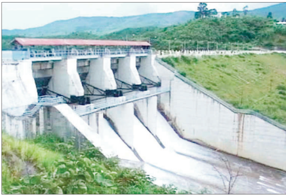
By: Snigdendu Bhattacharya

Dams to generate hydropower, considered a clean energy source by many, were expected to usher development in Manipur but they have caused more damage than gains, alleges the residents of villages around operational, incomplete, and failed dams.