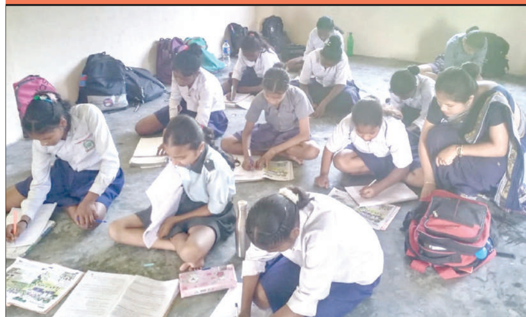
Lessons being imparted to school students as they sit on the floor at Chandmari Tea Model school, Panitola in Tinsukia district on Thursday.