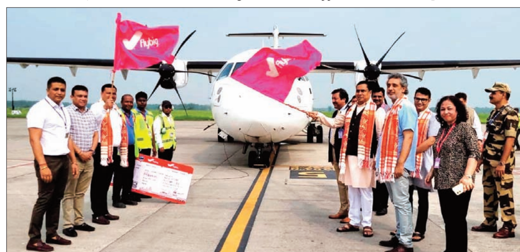
Minister Jayanta Mallbaruah flagged off the second FlyBig Flight services between Guwahati-Silchar-Guwahati with 63 passengers onboard at LGBI Airport, Azara in Guwahati on Thursday.

The NHRCCB feels that the absence of the chairman non-formation of the full body severely hampers the commission's ability to carry out its orders with efficiency, which is a noticeable aspect of the Assam Human Rights Commission. This will not only erode the credibility of the commission but also deprive the victim of access to justice. The appointment of a chairperson and formation of its body will not only protect the rights of the people of Assam but will also be considered as an appropriate mechanism for restoring the integrity and functioning of the Assam State Human Rights Commission, said the press release.