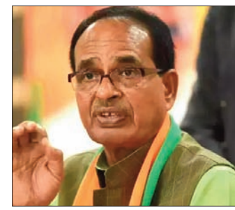
NEW DELHI, July 12 (PTI):

The maximum number of counting centres is in South 24 Parganas at 28, while the minimum is in Kalimpong at four. Some northern districts are also facing inclement weather.