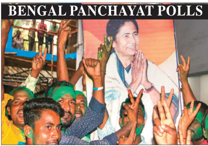
BENGAL PANCHAYAT POLLS

The BJP has in contrast won 21 and is leading in 5 seats. The CPI(M) has won 2 seats, while Congress has won 6 and is leading