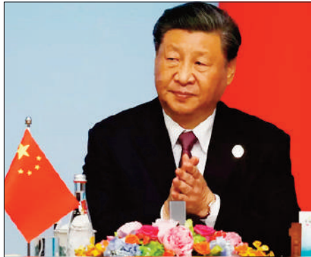
state-run Xinhua news agency.

"Since its launch in 2013, China and Pakistan have been advancing CPEC under the principle of extensive consultation, joint contribution and shared benefits, and have achieved a number of early harvests," he was quoted as saying by the