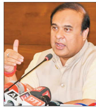
Himanta Biswa Sarma speaking at a podium during a press conference.

He also referred to Union Home minister Amit Shah's visit to the