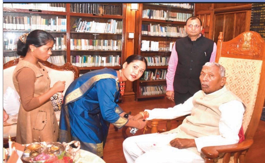
Celebration of Raksha Bandhan unfolded at Raj Bhavan, Shillong as ten children and two mothers from SOS Children's Village met the Governor of Meghalaya, Phagu Chauhan on Wednesday.