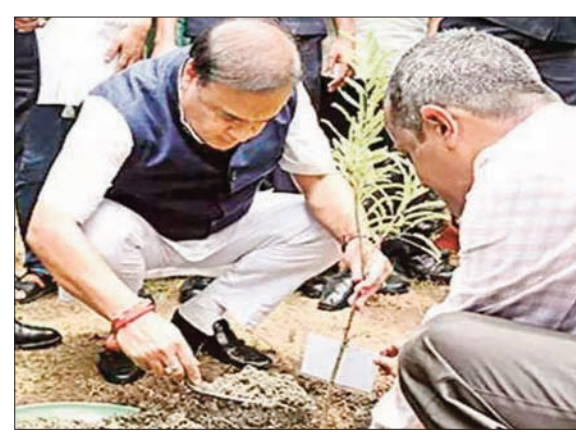
tribute to the timber industry and the economy.

Himanta Biswa Sharma, launched the movement by unveiling a web portal, a mobile app, and a theme song. The goal is to protect the environment, tackle climate change, and help farmers earn more. The movement is not limited to just three hours; it's planned until 2070. It aligns with the Prime Minister's efforts for climate conservation and involves modern technology and farmers. Farmers will grow valuable trees for food and profit, practicing agroforestry. Government nurseries are also involved. The government will plant valuable trees that benefit the environment and con-