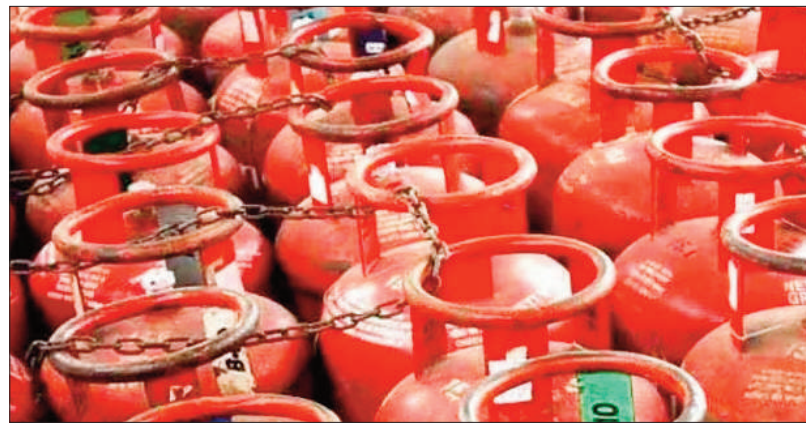
A mix of propane and butane results in the creation of LPG.

What may have compounded their woes is the rise in rates in August. Saudi CP for propane has gone up to USD 470 per tonne in August and that for butane to USD 460. This compares to USD 400 per tonne rate for propane and USD 375 for butane in July.