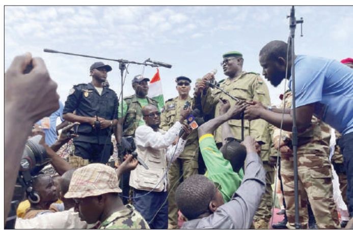
ECOWAS' efforts to restore constitutional order, and Senegal's government said it would participate in a military operation if it went ahead. But the junta does not appear interested in negotiation.

Senegal and Ivory Coast have both expressed support for