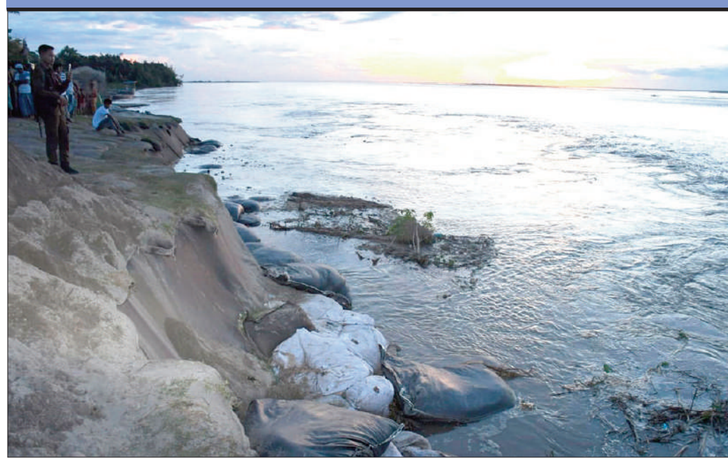
Erosion of Brahmaputra River at Bhajakhaiti village in Laharighat of Morigaon district.