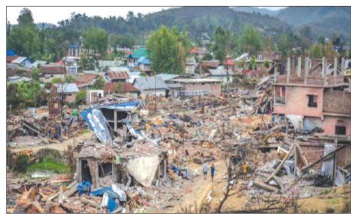
Churachandpur, resulting in tension in many districts of Manipur.

The Kuki-Zomi organisation, Indigenous Tribal Leaders' Forum, had planned the burial of 35 people, who were killed in ethnic riots in the state, on Thursday at a site in Haolai Khopi village of Churachandpur, resulting in tension in many districts of Manipur.