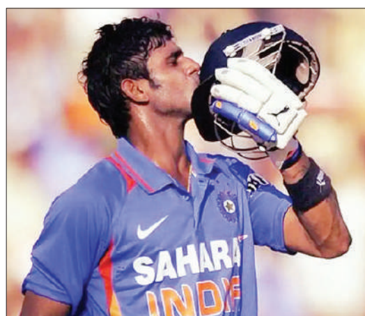
against Delhi at the Eden Gardens.

Tiwary finished his First-Class career just 92 runs shy of the 10,000-landmark (9908 runs) and averaged 48.56 with 29 centuries in a glittering 19-year career. He made his debut under Deep Dasgupta in 2004