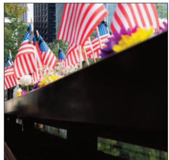
emony honoring all the victims.

The predominantly rural county of 25,000 people holds not just one but two anniversary commemorations: a morning service focused on first responders and an evening cer-