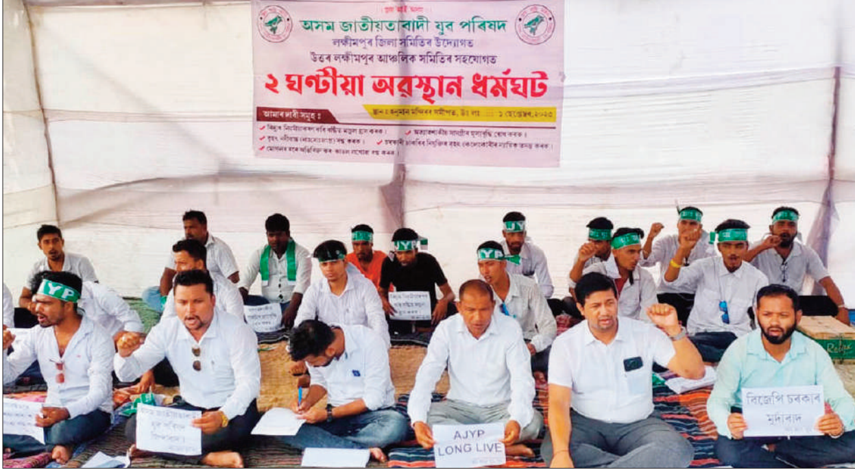
Asom Jatiyatabadi Yuba Parishad (AJYP) staging sit-in demonstration against unregulated electricity charges, construction of big dams and government job scandal in Lakhimpur.