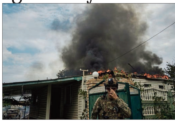
Ukraine, Belgorod Gov. Vyacheslav Gladkov said.

On Saturday afternoon, one civilian was killed and two wounded during shelling of Russia's Belgorod region bordering