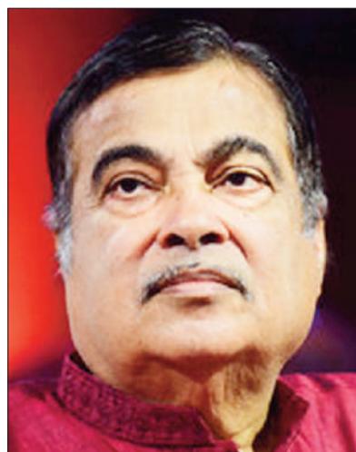
manufacturing diesel cars.

In the passenger vehicle segment, various carmakers including Maruti Suzuki India and Honda have already stopped