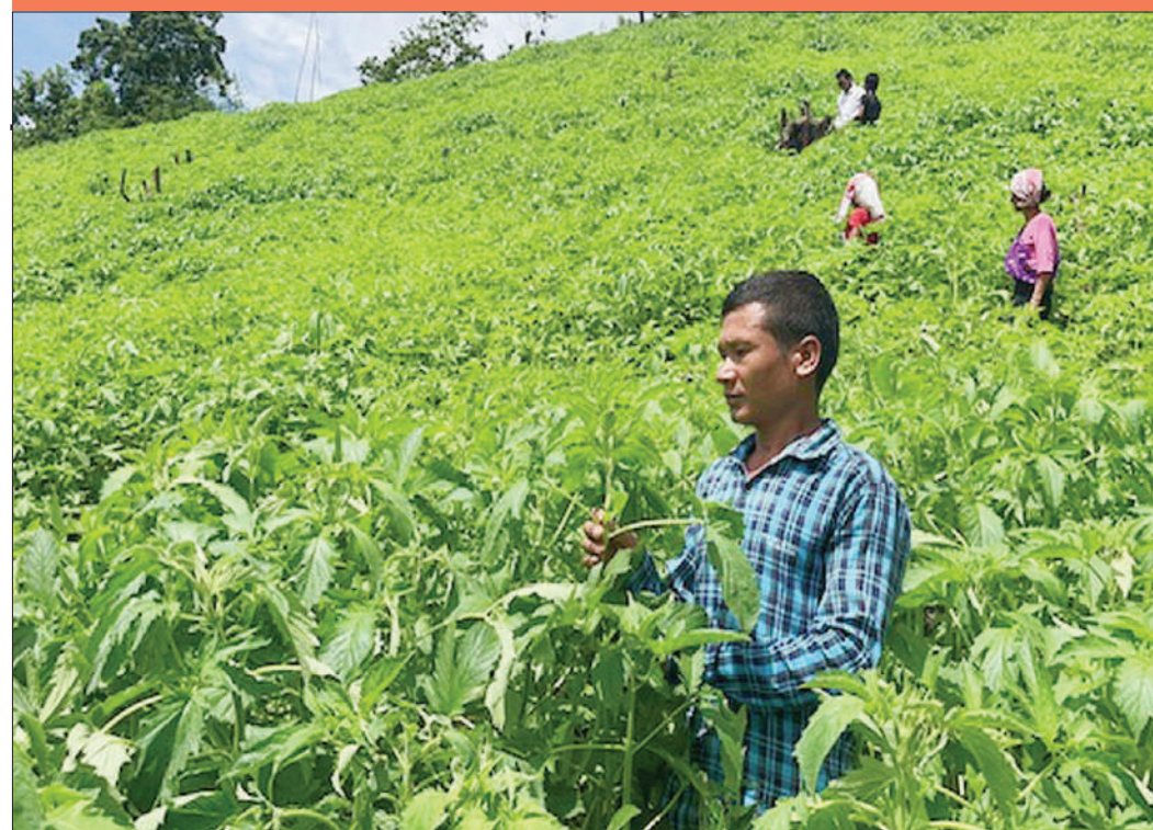
A farmer during Sesame (Til) cultivation at Karbi Anglong on Tuesday.

India's law aligns with International Treaty on Plant Genetic Resources for Food and Agriculture