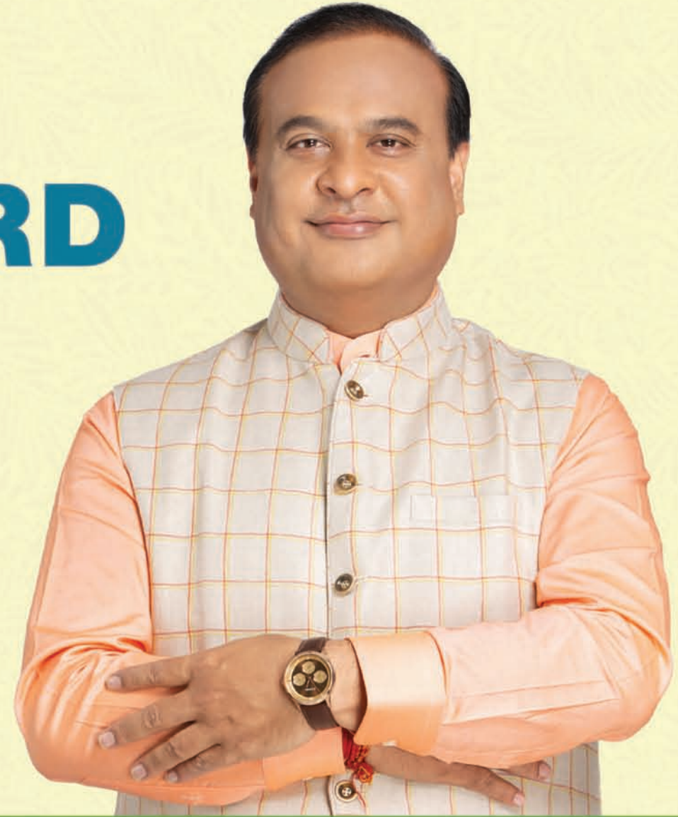
Dr. Himanta Biswa Sarma Chief Minister, Assam

Planting of most number of seedlings at one place by a team in 24 hours