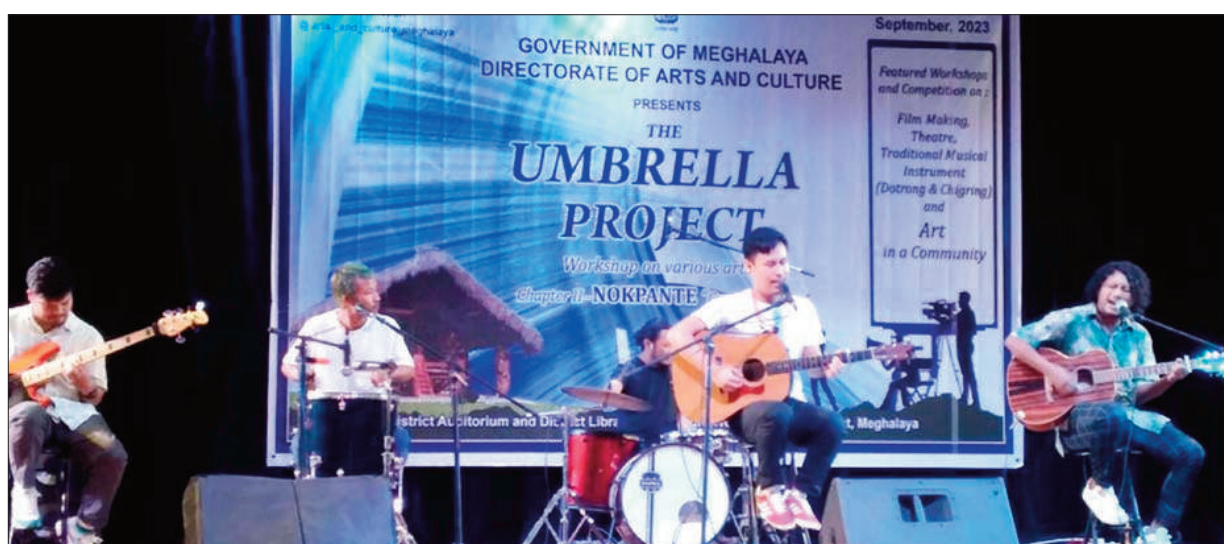
A five day workshop themed 'Nokpante' on film making, theatre, traditional musical instruments and art in the community starting from September 18 is being organised by the Arts & Culture department at the Tura district auditorium and library.