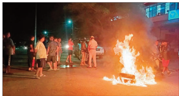
The protests in Imphal were sparked by the brutal killings of two Meitei students who had been

According to the notification, "The State Government has decided to suspend/curb mobile internet data services, internet/data services through VPN in the territorial jurisdiction of the state of Manipur for five days with immediate effect until 7:45 PM on October 1, 2023."