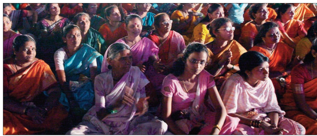
OBCs or Muslims.

Opposition party MPs flagged concerns that without a defined quota for OBC and Muslim women in the Lok Sabha and State Assemblies, the purpose of the Bill would be incomplete in a graded, caste-ridden society where the backward and marginalised castes and communities, in particular their women, were underrepresented in all spheres of life. The new bill provides one-third sub-quota for SC and ST women on the seats constitutionally already reserved for the SC and ST communities, and does not create a new category for