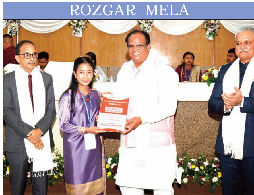
John Barla, Union Minister of State, Ministry of Minority Affairs handed over appointment letters to the new recruits in the various departments at the event of Rozgar Mela which was held at the State Convention Centre, Shillong on Tuesday.