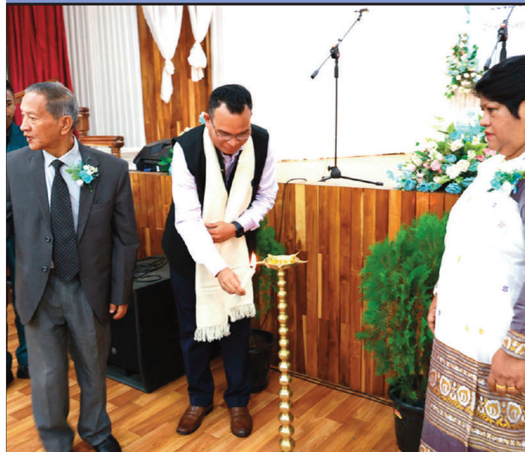
The College of Teacher Education (PGT), Shillong kick started its Diamond Jubilee Celebration at a programme held at the auditorium of the College. The celebration was graced by the presence of the Education Minister, Rakkam A Sangma on Tuesday.