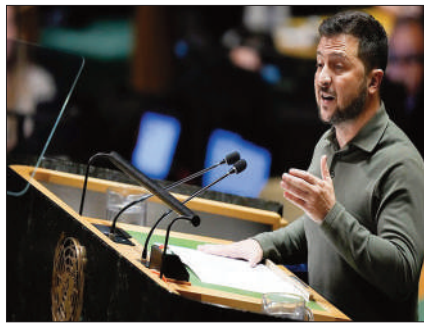
Ukrainian President Volodymyr Zelenskyy speaking at a podium during a press conference.

"Those children in Russia are taught to hate Ukraine, and all ties with their families are broken. And this is clearly a genocide," Zelenskyy said in remarks that ran 15 minutes — the meeting's often-disregarded time