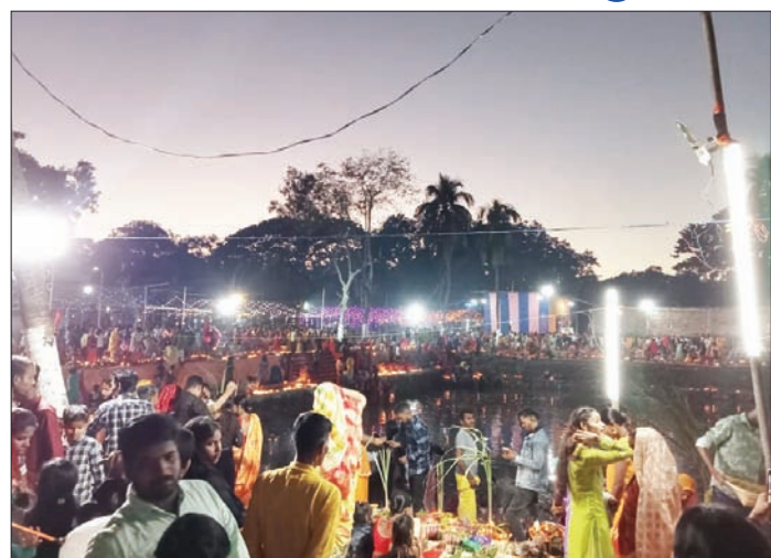
Bazar Ghat hosted the Sun idol for prayers. Devotees in Siliguri Basti, Amtola Basti, Tali Basti,

Mandoli Gaon, and Lanka, among other places, diligently followed rituals to invoke the blessings of