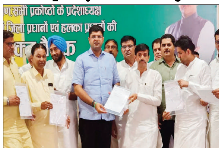
Haryana Assembly polls.

The JJP, formed after a vertical split in the Indian National Lok Dal, extended support to the BJP after the saffron party fell short of majority following the 2019