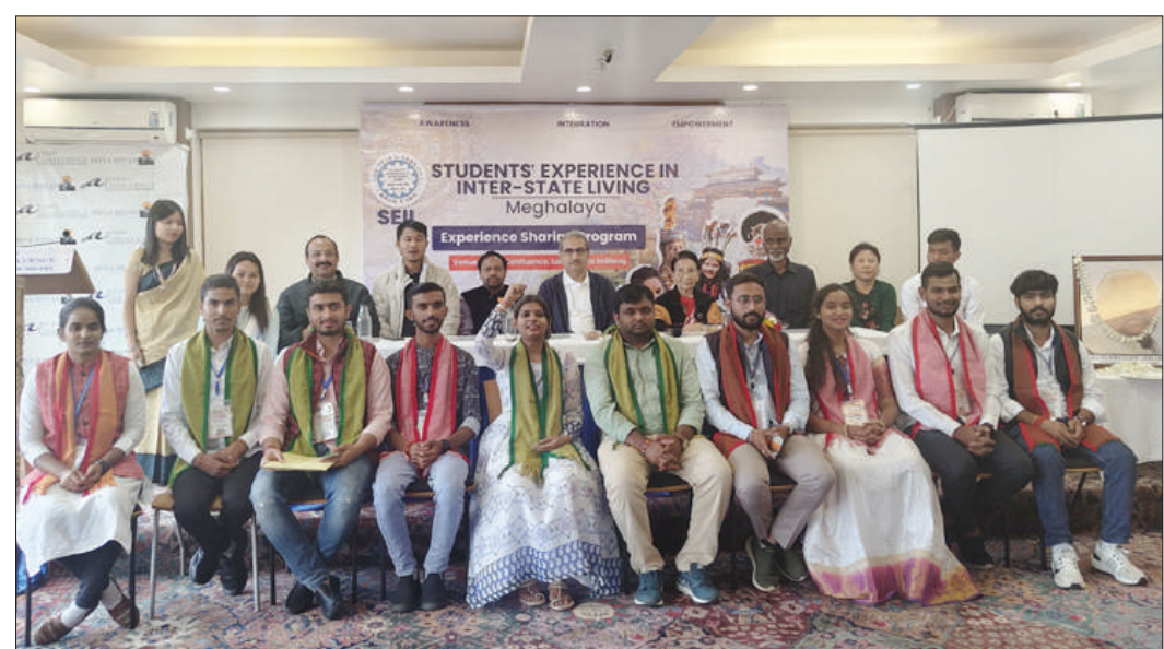
The Civic Reception Programme of SEIL was held on Sunday organised by ABVP, Meghalaya prant.