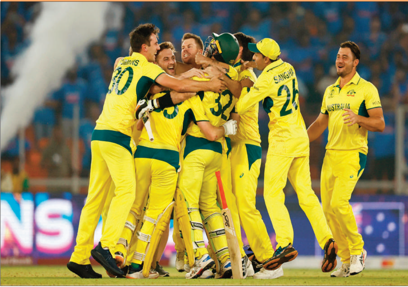
Australian players seen celebrating after winning the ICC Cricket World Cup 2023 in Ahmedabad on Sunday.