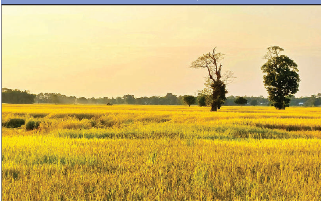
Nature's poetry unfolds in Dhakuakhana where sun-kissed paddy fields embody pure elegance on Sunday.