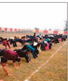
Forces, and state police. Experienced officials and women trainers are actively involved in imparting the necessary skills and knowledge during the training.

Recognising the potential of local youth and their pivotal role in the nation-building process, the 31st Battalion under BSF Guwahati Frontier is conducting pre-recruitment training from Sunday to Wednesday, with a particular focus on girls. The training aims to prepare youth for written competitive examinations and physical fitness tests for recruitment in the Central Armed Forces, Indian Armed