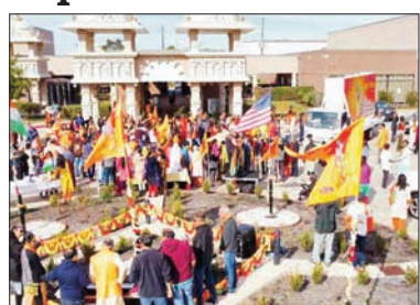
at eleven temples over six hours.

Criss-crossing across Houston's busy roadways, the procession, led by a truck, covered 100 miles with stopovers