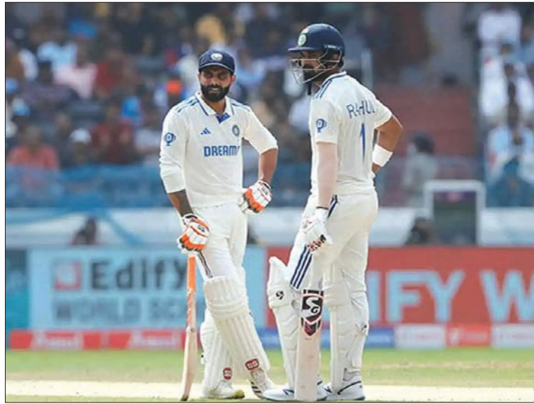
Kuldeep Yadav replacing Jadeja as the third spinner alongside R Ashwin and Axar Patel.

Rohit Sharma and Rahul Dravid have enough options to choose from with selectors adding three players to the squad -- Sarfaraz Khan, Sourabh Kumar and Washington Sundar. A straightforward selection will be Rajat Patidar, who was also a part of the 15 in Hyderabad. He could take Rahul's place in the middle-order with