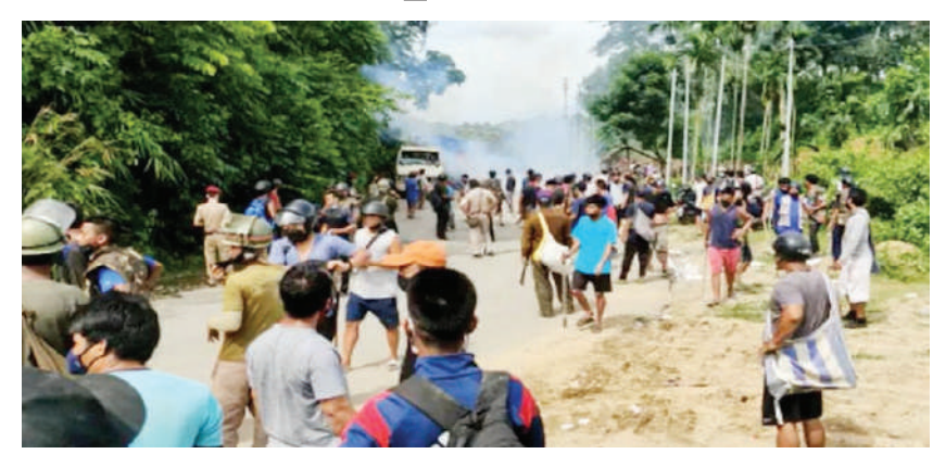
and Assam had taken an ugly turn in July 2021 when police forces of the two states exchanged fire at the inter-state boundary, leading to the death of six policemen and a civilian from Assam.

AIZAWL, Feb 13: Mizoram chief minister Lalduhoma on Tuesday said that he and his Assam counterpart Himanta Biswa Sarma have agreed not to allow any more violence along the disputed inter-state border.