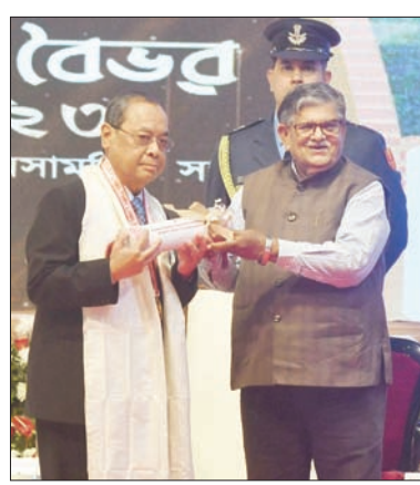
to serve as the Chief Justice of India. In a noteworthy comparison, the Assam Civilian Awards mirror the prestigious Bharat Ratna and Padma

GUWAHATI, Feb 13: The state Government on Tuesday conferred the state's highest civilian awards upon 22 outstanding personalities for their exceptional contributions to society.