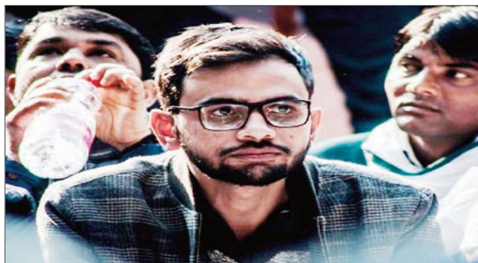
Khalid, activist Sharjeel Imam, and several others have been booked under the anti-terror law and several provisions of the Indian Penal Code for allegedly being the "masterminds" of the February 2020 riots, which left 53 people dead and over 700 injured.

The violence had erupted during the protests against the Citizenship (Amendment) Act (CAA) and the National Register of Citizens (NRC). Khalid, arrested by the Delhi Police in September 2020, had sought bail on grounds that he neither had any criminal role in the violence nor any "conspiratorial connect" with any other accused in the case.