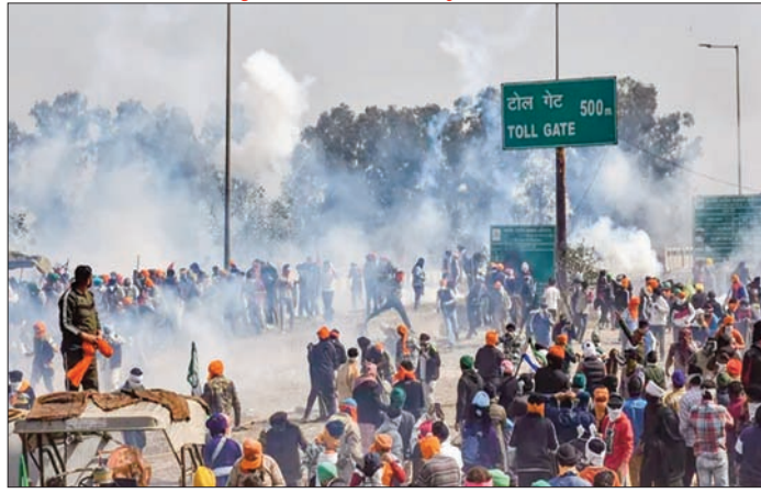
Protesters and policemen were injured in clashes at Shambhu and Data Singhwala-Khanauri borders.

On Tuesday, the first day of the 'Delhi Chalo' agitation, several