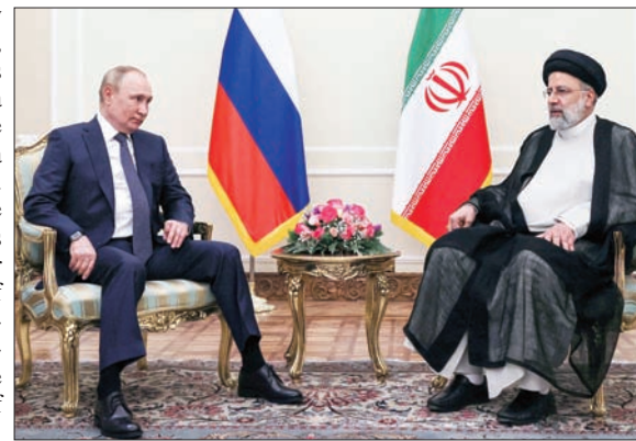
After the Soviet Union fell apart in 1991, even though the government under Boris Yeltsin tried to get closer to Western countries, the relationship with Tehran also improved quickly. Both countries were having economic problems and saw that they could help each other out. Russia decided to support Iran with its nuclear programme, which they said was for peaceful purposes, and also agreed to help Iran update its military, including the Army, Navy and Air Force, with modern Soviet weapons at that time.

In the late-1980s, the relationship between Iran and the Soviet Union started to improve, with their economic connections staying strong and cultural exchanges continuing. In 1985, Iranian airlines were allowed to fly through Soviet airspace. By 1987, Aeroflot, the Soviet airline, began flying to cities in Iran again. In 1990, Iran started sending natural gas to the Soviet Union once more and they paid for it by trading goods and services, including Soviet engineers' help in big Iranian infrastructure projects. By 1990, trade between the Soviet Union and Iran had grown to be