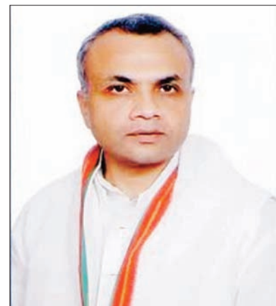
The Congress has witnessed a series of exits in the last few years with the likes of Ashok Chavan, Milind Deora,