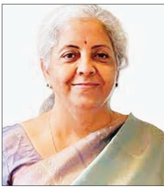
and domestic economic situation and financial stability issues.

In the meeting, the finance minister will review the current global