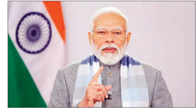
scale and speed, quantity and quality to every mission," Modi said.

NEW DELHI, Feb 14: Prime Minister Narendra Modi on Wednesday said India brings talent and innovation to the table and the International Energy Agency (IEA) will benefit if the world's fastest growing major economy plays a bigger role in the Paris-based organisation. In a recorded message for the ministerial meeting of the IEA, he said India has surpassed its Paris climate targets ahead of schedule and remains firmly committed to addressing the global issue.