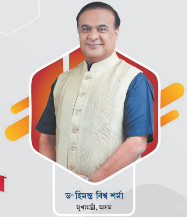
ড° হিমন্ত বিশ্ব শৰ্মা মুখ্যমন্ত্রী, অসম