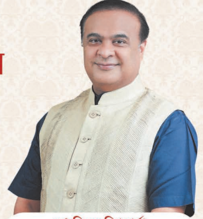
ড° হিমন্ত বিশ্ব শৰ্মা মুখ্যমন্ত্রী, অসম