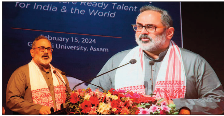
Union Minister of State for Electronics and IT Rajevee Chandrasekhar speaking at a podium during the Digital India #futureSKILLS Summit in Guwahati.

"The summit is being held in the country for the first time and I have been asked why it is being held here and not in Hyderabad or Delhi. The reason is that under the dynamic leadership of Assam Chief Minister Himanta Biswa Sarma, a semiconductor plant will come up very soon in the state, allowing interested youth to find employment opportunities without hav-