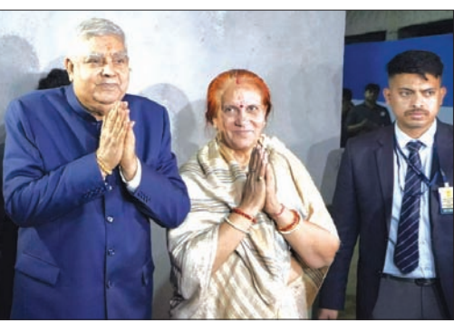
ning natural beauty and vibrant cultural diversity," Shah said in his official X handle. Arunachal Pradesh attained full statehood on February 20, 1987. The vision of Prime Minister Narendra Modi in implementing the Act East Policy is bearing rich dividends in the region, the Vice President said. "I commend successful efforts, policies and initiatives of the Centre in reaching (CONTD. ON PAGE-9)

ITANAGAR, Feb 20: Vice President Jagdeep Dhankha on Tuesday said that implementation of the Act East Policy has been yielding rich dividends in the northeastern region. Dhankha, who is visiting Arunachal Pradesh on the occasion of its statehood day, said India's composite culture is incomplete without the cultural mosaic of northeastern states. Prime Minister Narendra Modi and Union home minister Amit Shah also greeted the people of Arunachal Pradesh on their Statehood Day. "The people of Arunachal Pradesh are making rich contributions to India's development. The culture of the state is also greatly admired, particularly the vibrant tribal traditions and the rich biodiversity. May Arunachal Pradesh keep prospering for years to come," Modi said in a post on X. Shah expressed hope that the people of Arunachal Pradesh would touch new heights in development under the leadership of Chief Minister Pema Khandu. "PM Shri @narendramodi Ji's policy of all-inclusive development has contributed immensely to unlocking the economic potential of the state blessed with stun-