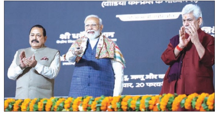
the occasion. "In the last 10 years, the country has witnessed a record number of schools, colleges and universities, including 50 new degree colleges in Jammu and Kashmir. As many as 45,000 children, who did not attend schools, have now been admitted to schools and girl students need not travel far for education. There was a time when schools were run while today, schools are enhanced," Modi added. The projects that were dedicated to the nation include permanent campuses for the Indian Institute of Technology-Bhilai, IIT-Tirupati, IIT-Jammu, IIITDM-Kancheepuram, Indian (CONTD. ON PAGE-9)

NEW DELHI, Feb 20: Prime Minister Narendra Modi inaugurated the campuses of three Indian Institutes of Management in Jammu, Bodh Gaya and Visakhapatnam on Tuesday and laid the foundation stone of several projects worth ₹ 13,375 crore, including permanent campuses for three IITs, 20 Kendriya Vidyalayas and 13 Navodaya schools. The Prime Minister dedicated, inaugurated and laid the foundation stone of the campuses and buildings at a public function at the Maulana Azad Stadium in Jammu. "The advancement of education and skill development sectors on such a scale was a distant reality 10 years ago. But this is the new India... The government of the day indulges in maximum expenditure for modern education of the present and future generations," he said on