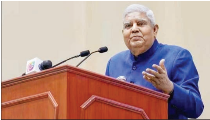
He will be the second vice president after M Venkaiah Naidu to address the state assembly, they said.