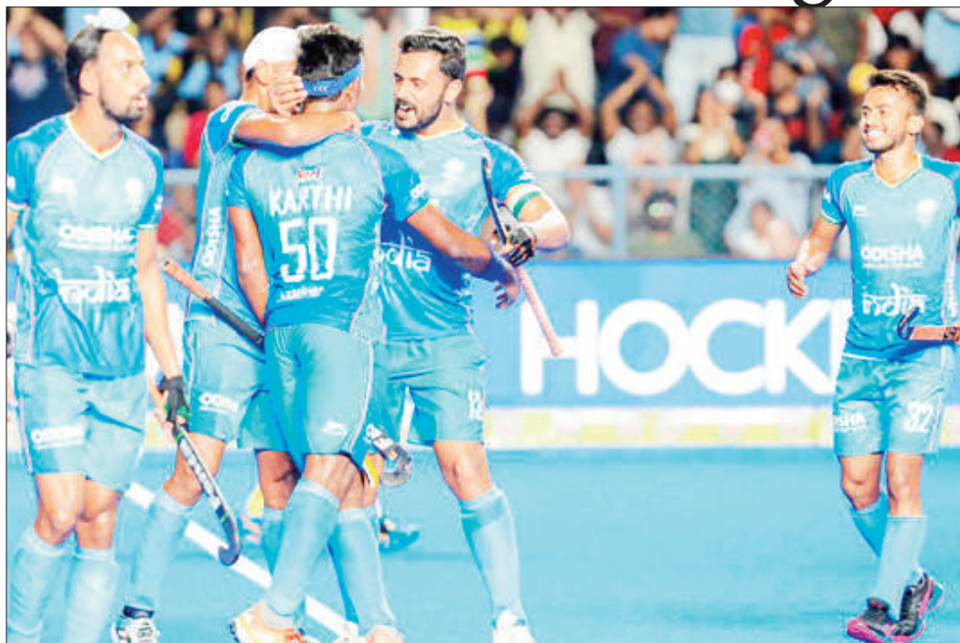
Sumit, Sanjay, Jugraj Singh, and Vishnukant Singh.

The defensive line includes Harmanpreet, Amit Rohidas, Jarmanpreet Singh, Varun Kumar,