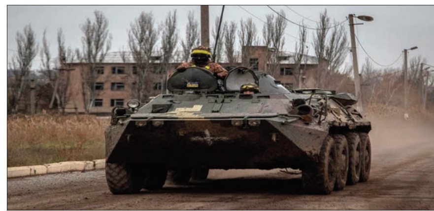
from crisis to crisis.

The EU's securing of Ukraine funding should be cause for relief. There is much to be said about the deeper causes that made Russia's full-fledged invasion possible, but Ukraine's war (since 2014, and especially since it caught the full attention of Europe and the United States from February 2022) is categorically defensive, preventing a re-ordering of borders by Russian tanks. The aid that has already been delivered has helped prevent the collapse of Ukraine in the face of a foreign invasion. Securing a financing package over four years will insulate that support from the political vicissitudes of an EU lumbering