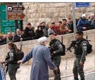
Egypt and Qatar have been struggling for weeks to find a formula that could halt Israel's devastating offensive in Gaza, but now face an unofficial deadline as the Muslim holy month of Ramadan approaches.

Separately, cease-fire efforts appeared to gain traction, with mediators to present a new proposal at an expected high-level meeting this weekend in Paris. The U.S.,