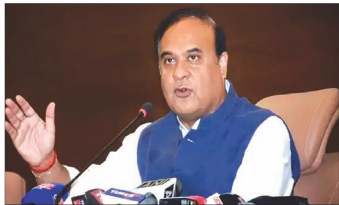
chief minister posted on X.

"This Act contained provisions allowing marriage registration even if the bride and groom had not reached the legal ages of 18 and 21 respectively, as required by law. This move marks another significant step towards prohibiting child marriages in Assam," the