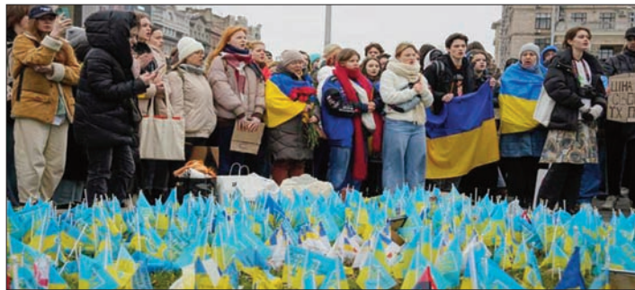
Twitter, after she arrived in Kyiv.

"More than ever we stand firmly by Ukraine. Financially, economically, militarily, morally. Until the country is finally free," von der Leyen said in a post on X, formerly