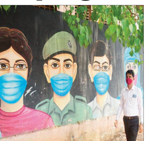
per cent in women -- from 2019 to 2021. Roughly 131 million people died globally from all causes in 2020 and 2021 combined, of which the pandemic caused about

profound changes that have occurred in the global health landscape following the first two years of the Covid-19 pandemic and longer-term trends in the future, they said. The research, coordinated by the Institute for Health Metrics and Evaluation (IHME), University of Washington (UW), US, presented updated estimates from the Global Burden of Disease Study (GBD) 2021. GBD 2021, the newly published most recent round of GBD results, is one of the first studies to fully evaluate demographic trends in the context of the first two years of the pandemic. Measuring mortality, excess mortality from the Covid-19 pandemic, life expectancy and population, the researchers estimated that global death rate jumped among people aged over 15 years -- by 22 per cent in men and 17