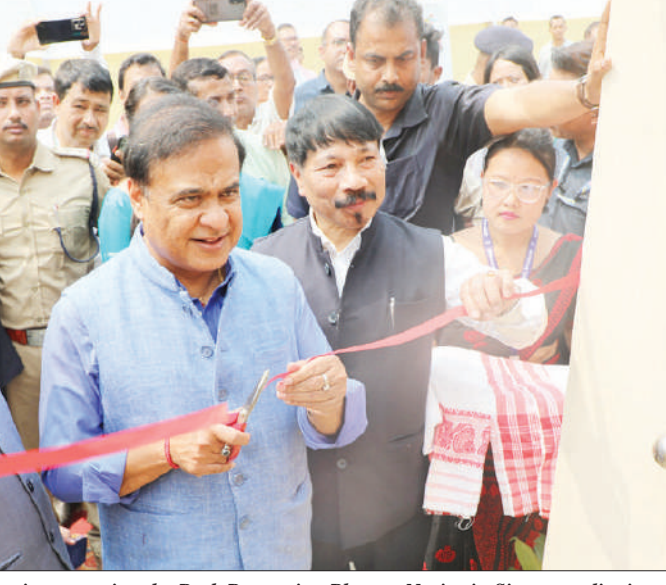
Chief Minister Himanta Biswa Sarma inaugurating the Pork Processing Plant at Nazira in Sivasagar district. Animal husbandry minister Atul Bora and education minister Ranaj Pegu were also present on Tuesday.