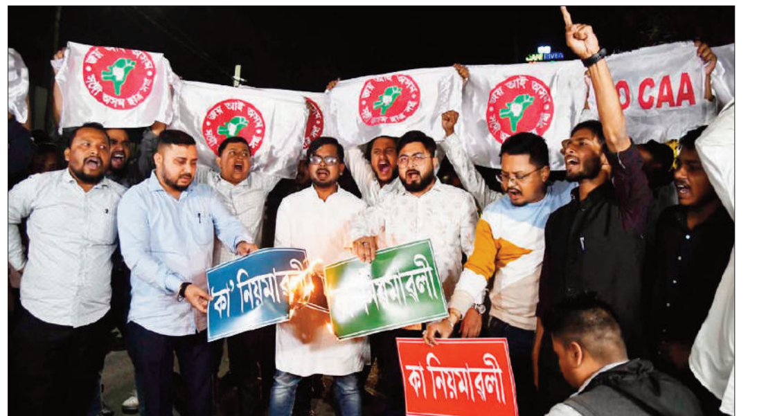
Activists of the All Assam Students' Union (AASU) burns the copies of Citizenship (Amendment) Act, 2019 during a protest after the central government notified the rules for implementation of the act in Guwahati on Monday.