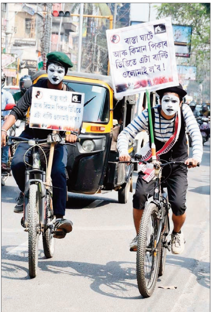
Nirbak in association with Guwahati Municipal Corporation presents Mime in Cycle an awareness campaign to stop spitting in Guwahati on Monday.

Upon return, they were welcomed with cultural programme arranged by RHQ-NER's women's welfare wing, Kalyanmayee.