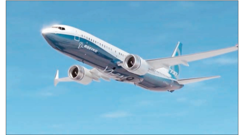
streamline our processes and address the panel's recommendations," he told staff. The day before the blowout on Alaska Airlines flight 1282, engineers and technicians at the airline wanted to remove the plane from service to examine a warning light tied to the plane's pressurization system, but the airline kept flying the plane and scheduled a maintenance check for late the following night, The New York