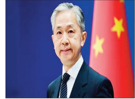
Wang, in his reply, said "Both China and India believe that an early settlement of the situation on the China-India border serves the common interests of both countries". "We hope that the two sides will follow the common understandings between the leaders of the two countries and the spirit of relevant agreements, maintain communication through diplomatic and military channels, and find a solution to relevant border issues that can be accepted by both sides at an early date", he said. China hopes that India will work in the same direction as China and approach the bilateral relations from a strategic height and long-term perspective, he said. "We should enhance mutual trust and avoid misunderstanding and misjudgement. We should step up dialogue and cooperation and avoid setting up obstacles. We should handle differences properly and avoid creating disputes. In this way, we will bring the bilateral relations to a sound and steady track of development", he said.