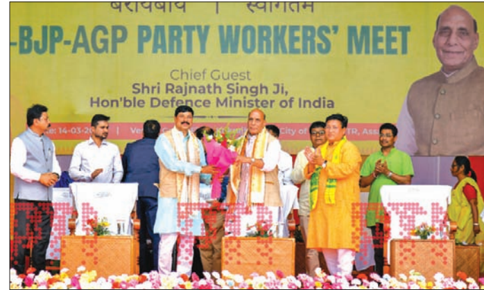
KOKRAJHAR, March 14: Union defence minister Rajnath Singh on Thursday claimed that it is guaranteed that the NDA government will return to power winning over 400 seats during the upcoming Lok Sabha elections. Addressing party workers of three NDA allies in Assam -- BJP, AGP

and UPPL, Singh said there will be no kutcha houses in the state and assured people that everyone will get pucca dwelling units if the Narendra Modi-led government returns to power for the third consecutive term. "There is no doubt at all that our government will be formed at the Centre. I believe the NDA will win