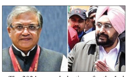
The 2024 general elections for the Lok Sabha, along with four state assemblies, are expected in April-May amid indications that the EC may announce these polls as early as this Friday. Earlier in the day, at the selection panel meeting chaired by the prime minister, Congress leader Adhir Ranjan Chowdhury gave a dissent note, raising questions over the procedure adopted to choose the election commissioners. The selection committee has one Union minister -- home minister Amit Shah -- as