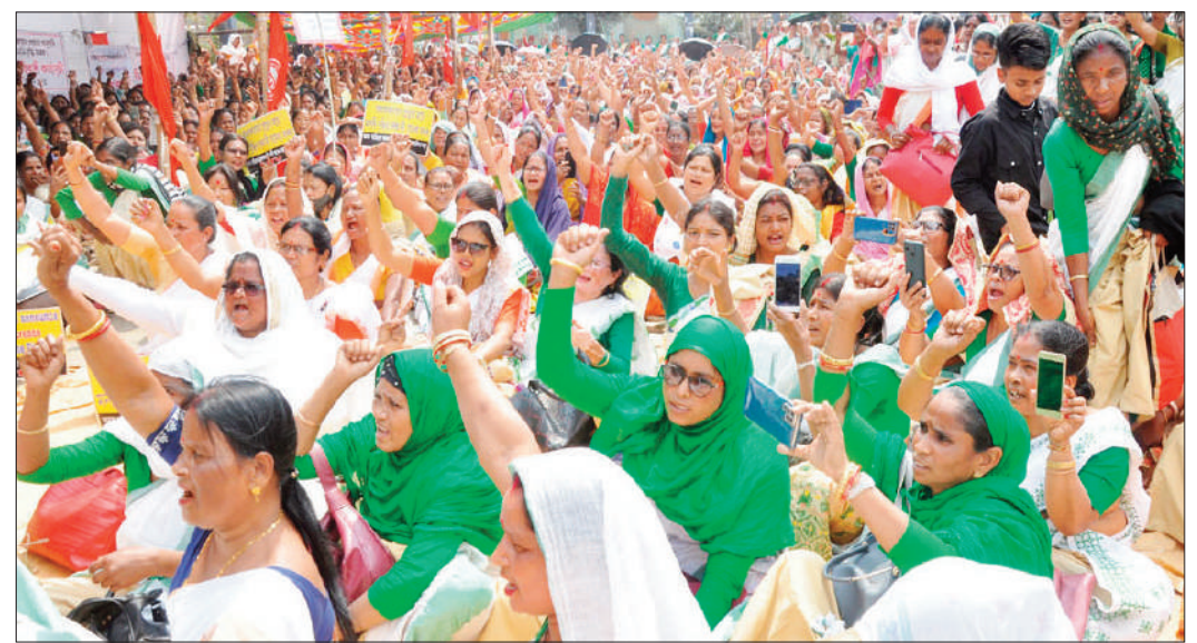
Members of Anganwadi Karmi and Sahayika Santha staging a day night protest at Chachal Dharna Ground (27 days running) in Guwahati on Thursday.