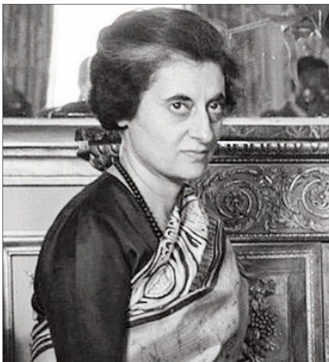
By: Yashwant Deshmukh & Sutanu Guru

If someone had suggested in March 1967 that the beginning of the end of the Congress party as the dominant political force of India had started, they would have been dismissed as a crackpot. In hindsight, it is clear that the general elections held in February 1967 not only heralded the end of its almost complete monopoly over power but also unleashed forces that would eventually lead to the electoral routs of 2014 and 2019.