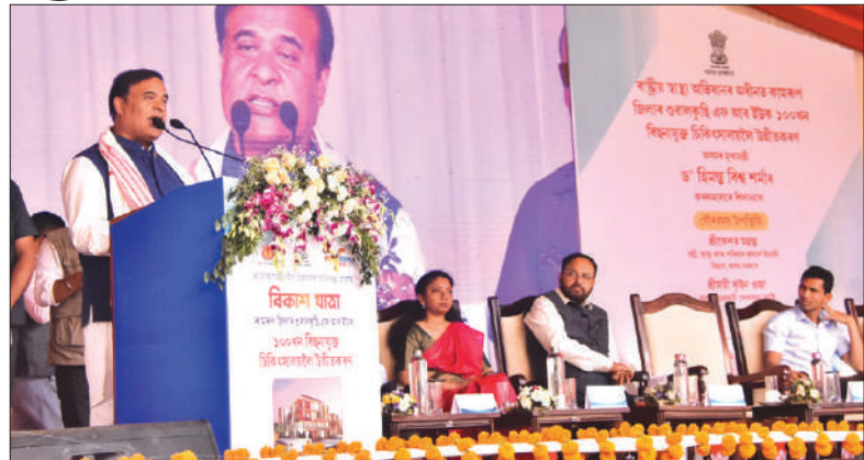
Assam so far on the portal since it opened on Tuesday, Sarma claimed. "The NRC has the details of the number of people who have applied, and due to technology, all data will be available on the internet and nothing can be hid-

non-Muslim migrants from Pakistan, Bangladesh and Afghanistan who came to India before December 31, 2014. Sarma said the act is very clear that the cut-off date for application of citizenship is December 31, 2014, and in Assam, with the updation of the National Register of Citizens, people who applied for it and did not find their names in that list, will only apply for CAA. "People seeking citizenship have to give evidence that they entered before 2014 and the NRC will be the proof in Assam, but in other states, this does not exist. If they have not applied for NRC, it becomes clear that they were not there in the state before the cut-off date, and as such cannot get citizenship," he said. There has been no application from