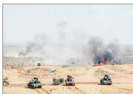
equipment. The field firing ranges at Pokhran in Rajasthan is located near the international border.

'Bharat Shakti' exercise was held for about 50 minutes during which India showcased the prowess of its indigenous defence