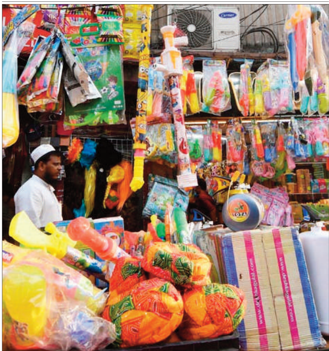
Market shops displaying varieties of colour powders, pigments, plastic made holi pichkaris (water gun toys) etc. Ahead of Holi at Guwahati on Saturday.