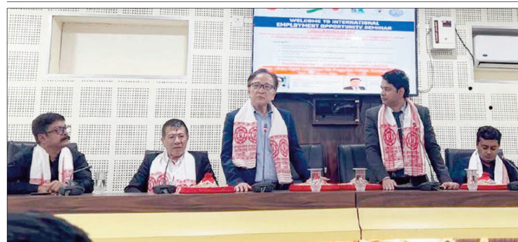
Complete solution for Japanese Language Training to Placement Solution at Pragjyotish College in Guwahati on Saturday.