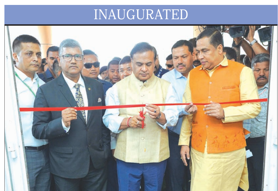
Chief minister Himanta Biswa Sarma inaugurating the Hospitality Skill Development Centre of Excellence, a joint initiative of the Assam Tourism Development Corporation (ATDC), Union ministry of skill development and entrepreneurship (MSDE), Indian Hotels (IHCL, Taj Group) and Tata STRIVE at Sonapur.

"Somehow, Jitendra Singh has some personal vendetta against me, I don't know the reason for it. Finally, (CONTD. ON PAGE-2)