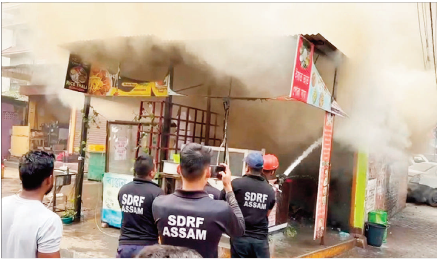
Firefighters attempt to douse a fire that broke out in a restaurant at Hari Mandir Path, Down Town in Guwahati on Tuesday.