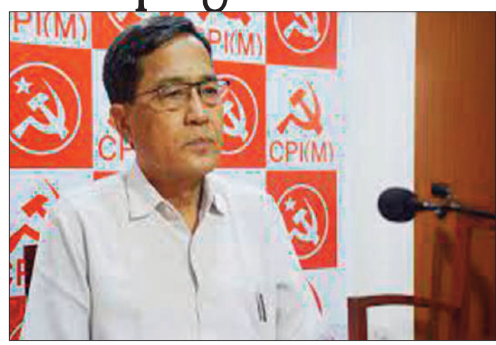
mentary elections. Leaders of the Left parties and the Congress will join rallies for the submission of nominations by the INDIA bloc candidates for two Lok Sabha constituencies and the bypoll in the Ramnagar

in the campaign, he said. "We will deploy all our resources in the ensuing elections. I appeal to electors to take note of the country's disastrous situation before casting their votes in the polls," he said.