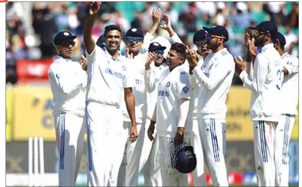
him wickets of Tom Hartley and Mark Wood, putting India on the cusp of a massive win.

Ben Foakes went for a wild slog sweep off Ashwin only to miss the ball completely, giving India's premier spinner his 36th five-wicket haul in Tests. Bumrah's fiery spell in the afternoon got