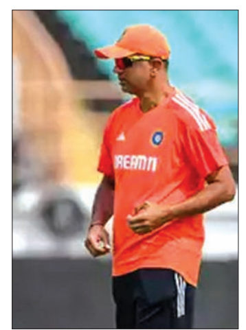
"Rohit and I are selecting playing 11. Sometimes even I don't know who is contracted and who is not. So, no one is out of the mix as far as we are concerned," Dravid later said in the post-match press conference.

Kuldeep Yadav twinkled radiantly with his left-arm wrist spin besides chipping in with some handy runs lower down the order.