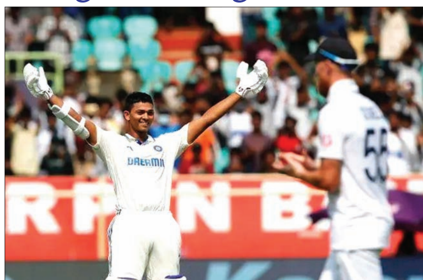
Kuldeep Yadav was adjudged player of the match for his seven-wicket haul and a feisty 30 down the order that helped India stretch the lead.

"He's got a long way to go, but it's amazing to be in this position. When a guy's got talent like that who can put pressure on the bowlers from the word go, there will be lots of challenges going forward. He is a tough guy and loves the challenges," said Rohit.