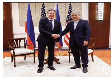
Secretary of State Antony Blinken and Philippine Secretary of Defense Enrique Manalo shaking hands.

"We have a shared concern about the PRC's actions that threaten our common vision for a free, open Indo-Pacific, including in the South China Sea and in the Philippines"