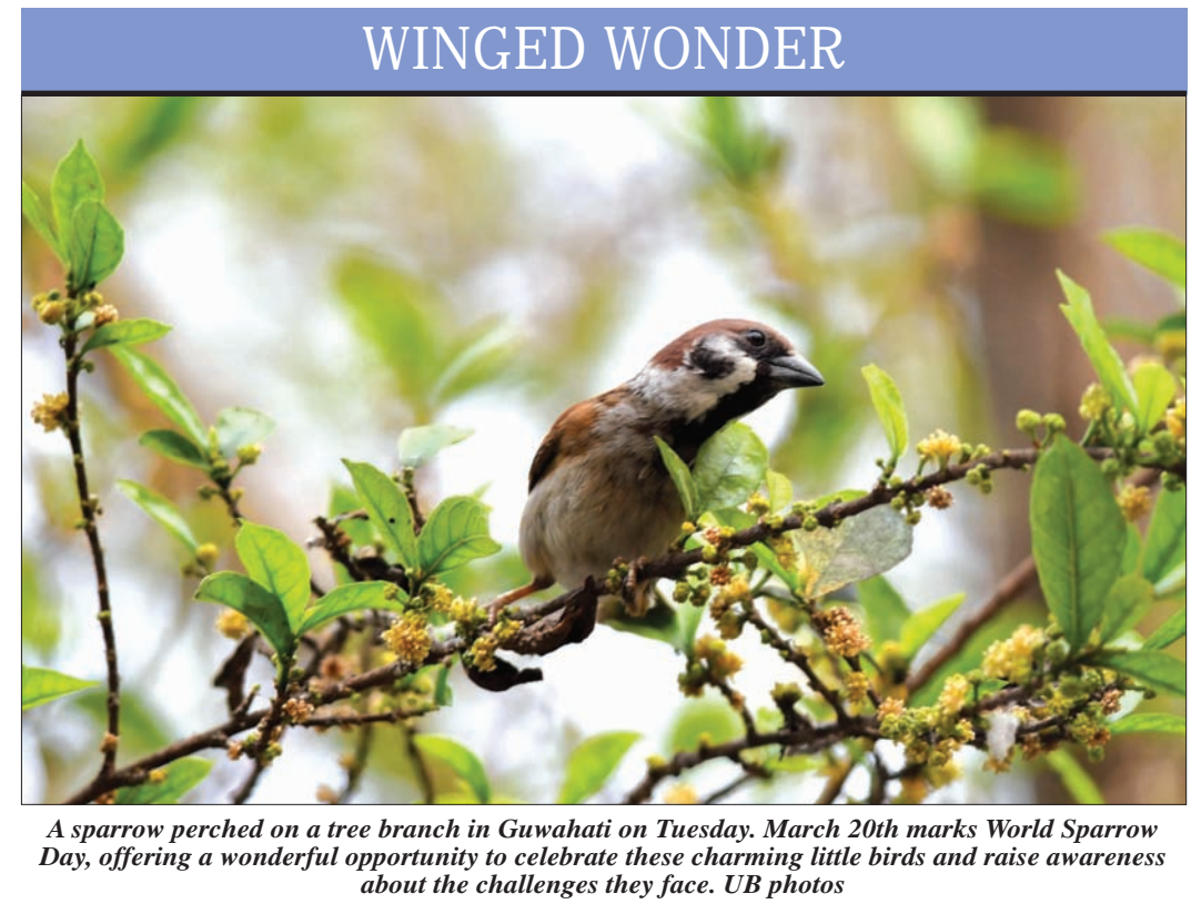
A sparrow perched on a tree branch in Guwahati on Tuesday. March 20th marks World Sparrow Day, offering a wonderful opportunity to celebrate these charming little birds and raise awareness about the challenges they face.