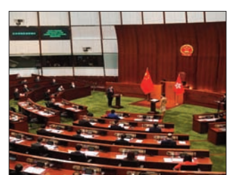
Hong Kong leader John Lee speaking at a special session.

The legislature, which is packed with Beijing loyalists following an electoral overhaul, has expedited debate. Since the bill was unveiled on March 8, a committee held daily meetings for a week, following an appeal by