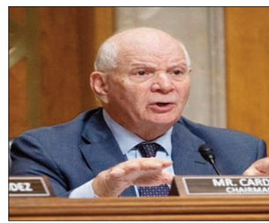
Senator Ben Cardin speaking at a press conference.

safeguarding individuals and families against religious persecution, resonating with global humanitarian principles, they said.