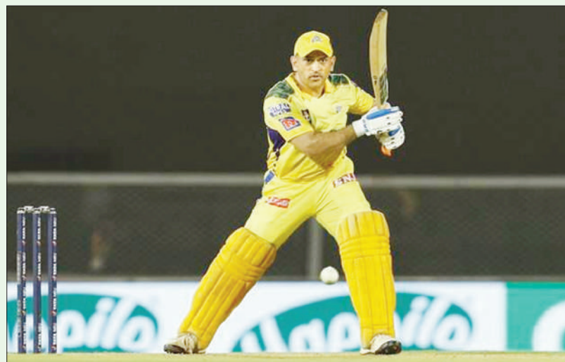
Asian Games last year. CSK and Dhoni share an unbreakable bond and the World Cup-winning captain is expected to keep a significant role in the franchise going forward albeit not as a player.

The 27-year-old from Maharashtra is not new to captaincy, having led the Indian team to the gold medal in the