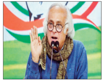
the 2020 Ladakh Hill Council Polls.

Incidentally, he said, the BJP had promised Ladakh's inclusion in the Sixth Schedule in its manifesto for the 2019 Lok Sabha Elections and