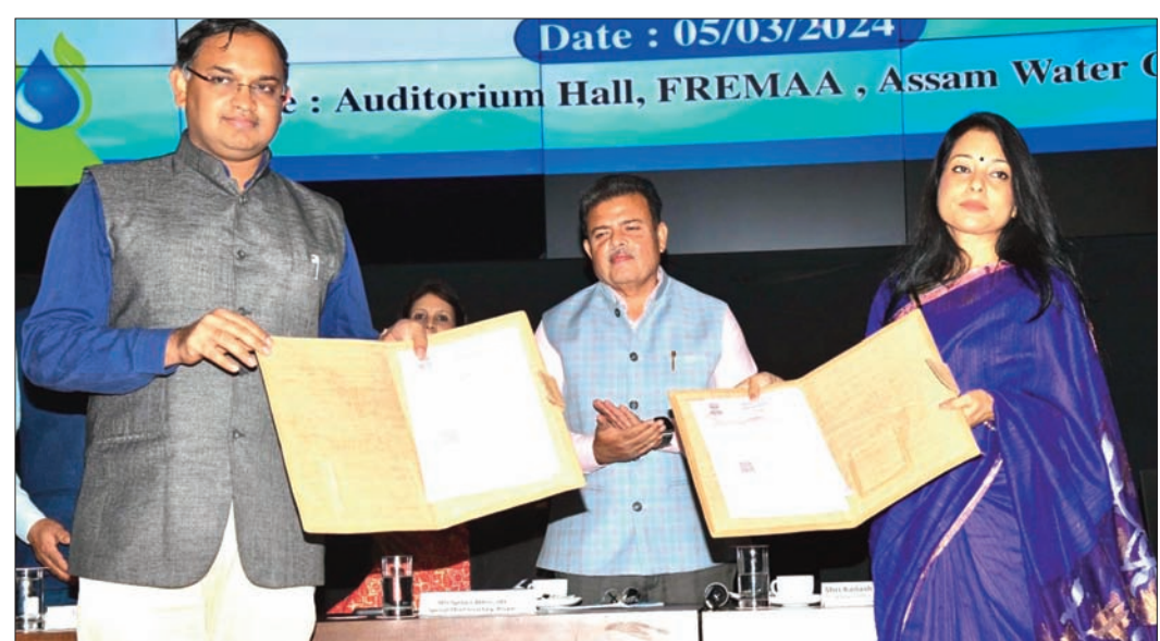
MoU Signing Ceremony between Jal Jeevan Mission, PHED Assam and Department of Higher Education (DHE) for Jal Vidya Program at Auditorium Hall, FREMAA, Assam Water Centre in Guwahati on Tuesday.