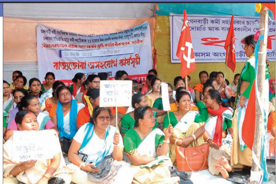
Members of Assam State Anganwadi workers and helpers Association staging a protest demanding on increased monthly wages in Guwahati on Thursday.