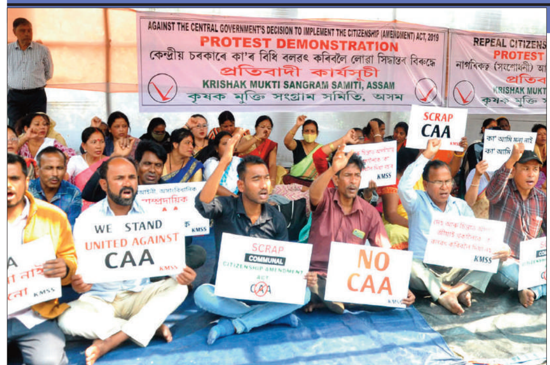
Activists of Krishak Mukti Sangram Samitee, staging a protest demonstration at Chasal dharna ground against the CAA in Guwahati on Thursday.