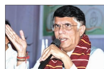
Indian citizenship to people entering the state from Bangladesh as per the Assam Accord. The Citizenship (Amendment) Act, 2019 (CAA) seeks to provide citizenship to Hindus, Jains, Christians, Sikhs, Buddhists and Parsis entering India on or before December 31, 2014 from Bangladesh, Pakistan and Afghanistan after five

GUWAHATI, March 6: Senior Congress leader Pawan Khera on Wednesday said the Citizenship (Amendment) Act, 2019 will be repealed if the party comes to power after the Lok Sabha elections. He also took a dig at Prime Minister Narendra Modi for not visiting Manipur, which has been witnessing ethnic strife since May last year. Addressing a press conference here, Khera said, "The cut-off date of 1971 is sacrosanct for Assam. But CAA will take it away and 2014 will be the new cut-off date. It disrespects the sacrifices of the martyrs of Assam Agitation." He was referring to the cut-off date of March 25, 1971, for granting