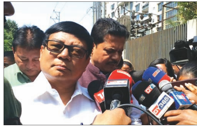
Lok Sabha elections. Assam chief minister Himanta Biswa Sarma on Tuesday said Congress leader Rahul Gandhi will also be issued a summons regarding the clash and the opposition leader will have to be physically present before police