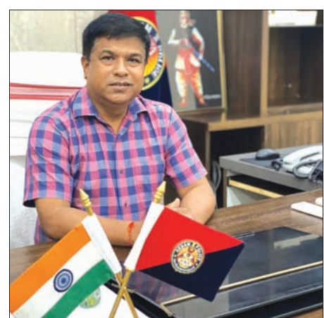
impossible tasks are achieved with the generosity and co-operation of these groups. One such example is the well-planned Assam Police

HT Bureau GUWAHATI, March 6: Assam police guest house amidst the picturesque Kohora range of the Kaziranga National Park in Golaghat district enthralling visitors. Kaziranga National Park is a UNESCO World Heritage Site, a home to many species of birds, plants and flowers. These include the world famous rhino, tigers, elephants, wild buffaloes, deer among others. High profile individuals including the President, Prime Minister and many high ranking government officials come to this heritage site for various government programmes. People's representatives from foreign countries are also guests to enjoy the beauty of this beautiful creation of nature. It is said that behind every initiative, big or small, there is a thoughtful plan of a visionary, enterprising and pioneering person. On the other hand, many like-minded individuals contribute to its effective implementation. Many