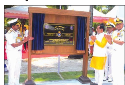
"Similarly, we expect that this unit will provide situational awareness to the Indian Navy in maintaining good maritime domain awareness of the entire region. INS Baaz to the east in the Andamans and now the INS Jatayu in the west will serve as eyes and ears to the Navy to safeguard our national interest," he said. He said it was crucial to recognise the pressing need for heightened surveillance amidst the prevailing geopolitical developments, which underscores the strategic significance of Lakshadweep to India. "The Indian Ocean region is witnessing an upsurge in maritime terror, crime, and piracy. (PTI)