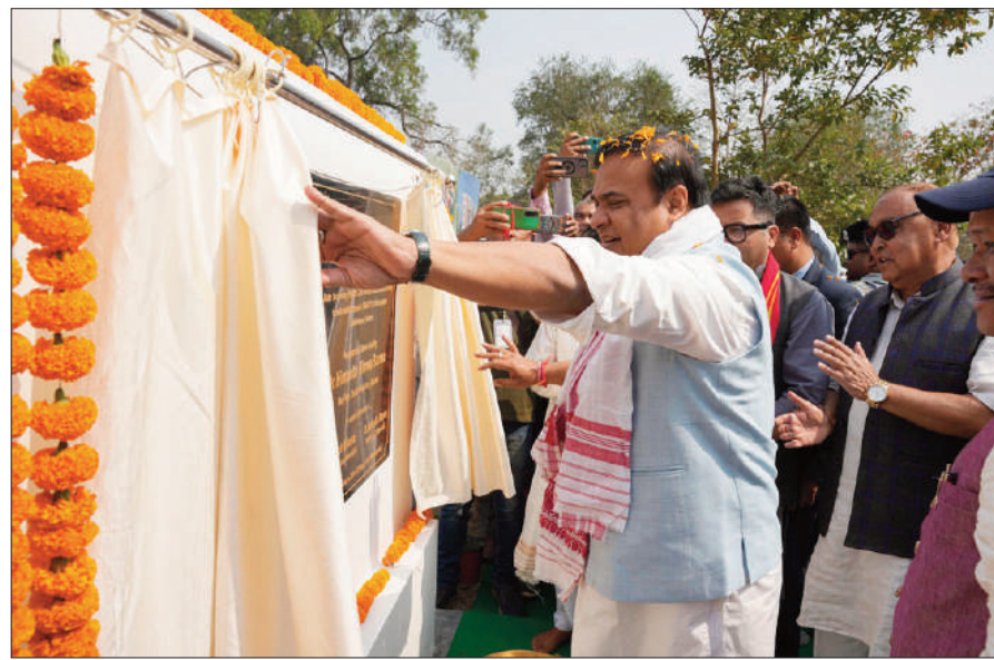
Chief Minister Dr. Himanta Biswa Sarma inaugurated Narayanpur Civil Hospital during the Vikash Yatra programme at Narayanpur on Wednesday.