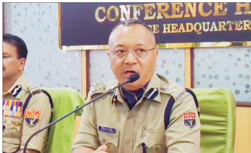
and do what it takes to ensure that this kind of activities don't take place," he said. Whether the cases of extortion is indicative of HNLC not serious for peace talks,

"Hence, when this issue had come up to us, we had a very prompt meeting few weeks (ago) - I will not give details as it was a closed-door meeting - and we had given instruction to the police to go ahead