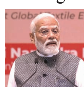
for boosting the agri-economy in the Union territory, according to an official statement. With the Lok Sabha elections around the corner and opposition parties seeking an announcement on assembly polls in Jammu and Kashmir, the Prime Minister's scheduled visit has acquired a keen political

SRINAGAR/NEW DELHI, March 6: In his first visit to Kashmir after abrogation of Article 370, Prime Minister Narendra Modi will unveil multiple development projects worth more than ₹ 6,400 crore and address a public meeting in Srinagar on Thursday. Stringent security arrangements have been put in place to ensure an incident-free visit as Bakshi Stadium, the venue of the Prime Minister's rally, has been draped in tricolour, officials said. Modi will attend the 'Viksit Bharat Viksit Jammu Kashmir' programme at the stadium in Srinagar and inaugurate initiatives worth nearly ₹ 5,000 crore