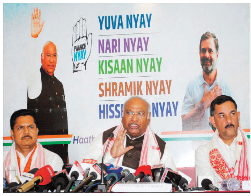
major issue in India, with 65 per cent of the educated youths being jobless. We will reserve 50 per cent of posts for women. We will give ₹ 1 lakh as apprenticeship stipend to every unemployed youth during his or her training period till he or she gets a proper job." Kharge addressed the massive crowd

spoke lies about it," he added. Kharge also alleged that the BJP was "looting" the country's wealth and handing it over to the rich. "PM Modi waived ₹ 16 lakh crore loans of his few rich friends. The rich are getting richer and the poor are getting poorer. But we will never loot and divide the country like BJP and RSS that are experts in creating fights between communities, castes and religions," he claimed. He also criticised Modi for not visiting Manipur even once despite the state reeling under ethnic clashes since May last year. Kharge said that while party leader Rahul Gandhi led the 'Bharat Jodo Yatra' crisscrossing the country, Modi was working for 'Bharat todo' or dividing the nation. "Prime Minister Modi is continuously attacking the Congress and the Gandhi family as he is scared and trembling in fear of losing power," he claimed. "One who can't feel the pain of the poor does not have the right to stay in power," Kharge added. On the employment scenario in the country, he claimed, "Joblessness is a