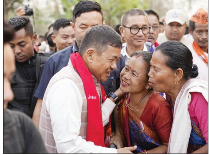
Nihang Langso Karbi Cultural Society Playground, Langloksa, where he addressed a large gathering (CONTD. ON PAGE-2)