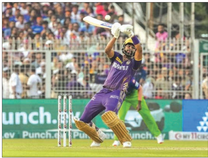
Salt's explosive start helped KKR reach 222/6 against RCB.

But Iyer held his nerves to produce his 20th IPL fifty, his first