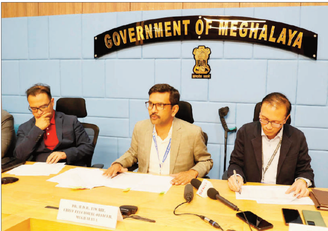
Chief electoral officer of Meghalaya Dr BDR Tiwari addressing media, informing about polling process.

it said. More than 3,500 police personnel and 12 companies of the Central Armed Police Force (CAPF) were deployed in the Lok Sabha polls and polling was held under a peaceful atmosphere, the department said. Six candidates, one each from ruling Zoram People's Movement (ZPM), main opposition Mizo National Front (MNF), Congress, BJP, People's Conference (PC) party and an independent candidate are in the fray. (PTI)