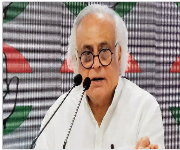
Modi Sarkar tried to suppress)," he said.

"Stagnant real wages have dragged down consumption growth as revealed by the NSSO's Consumption Expenditure Survey which showed a decline in rural consumption for the first time in almost 50 years (and which the