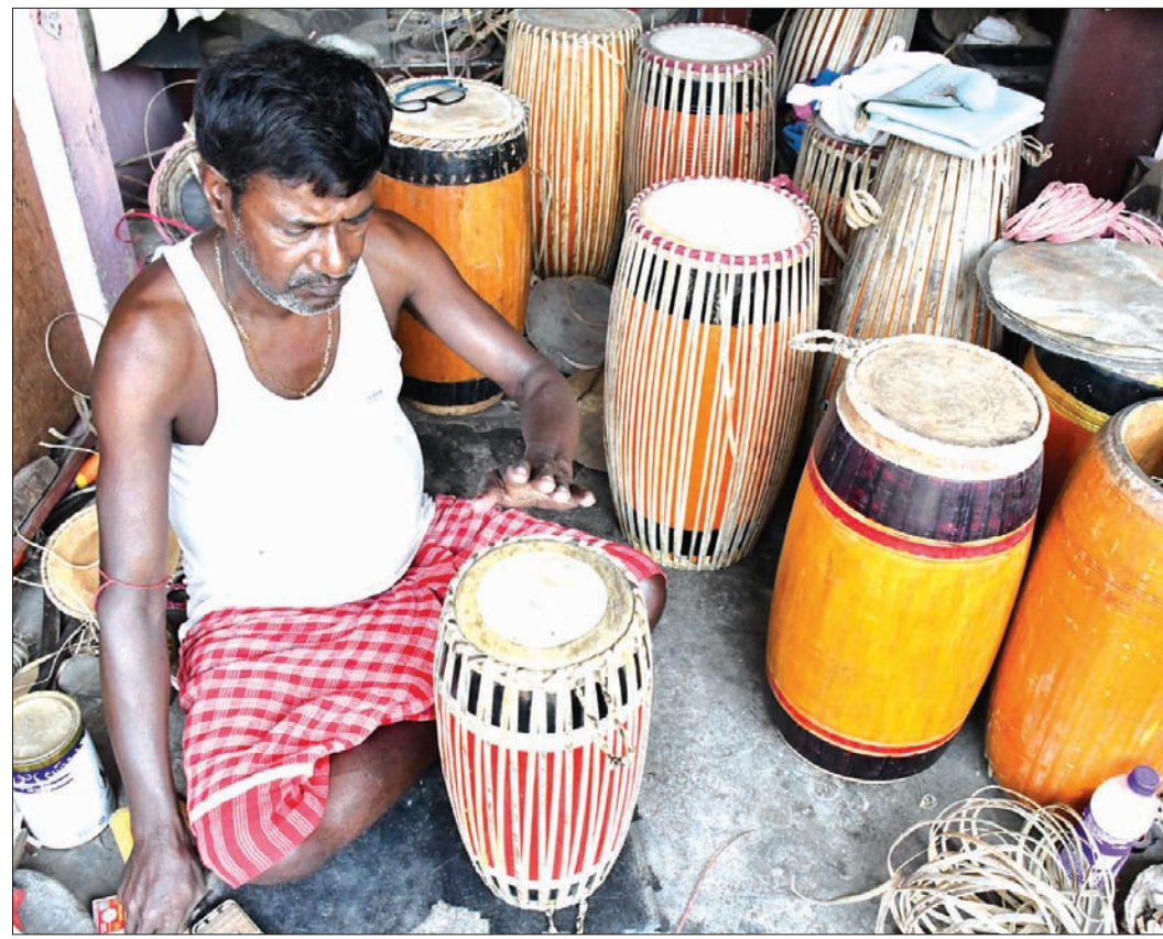
Artisan making Bihu Dhol ahead of Rongali Bihu at Rajgarh road in Guwahati on Tuesday.

Elections for Guwahati seat for upcoming LS polls will be held in the third phase on May 7. In 2019, Guwahati had 21,81,319 voters, including 11,03,376 male voters, 10,77,865 female voters, and 78 third-gender voters. In 2014, there were 19,22,270 voters.