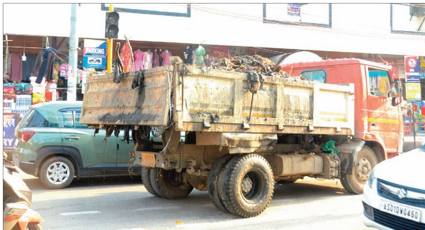
GMC garbage carrying truck seen openly carrying waste at Silpukhuri in Guwahati on Tuesday.

Alimon Begum, residing in Kamarpara Kuwari Pukhuri under Kalaigaon Police Station in Darrang district, and Sukurjan Begum, hailing from Simalguri road under Rowta Police Station in Udalguri district, were both found present at the location of the raid, SRCB Road, Railway Gate No. 3, Fancy Bazar under Panbazar Police Station. The STF, in collaboration with local authorities, is currently undertaking necessary formalities following the apprehension of the suspects and the recovery of contraband items. This operation underscores the continued efforts of law enforcement agencies to curb the menace of drug trafficking in the region, ensuring the safety and well-being of the community.