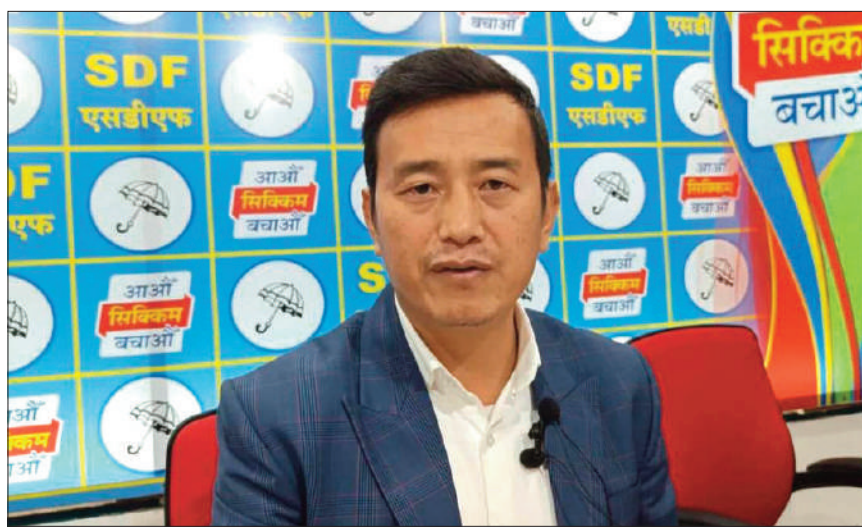
party, Hamro Sikkim with the SDF.