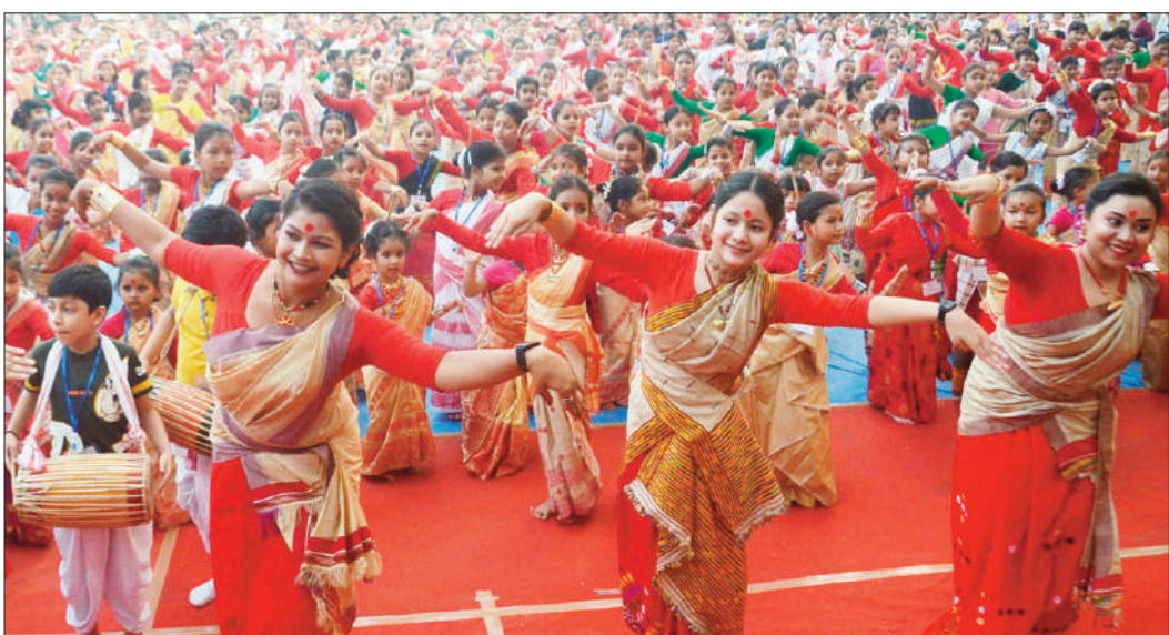
Children and young girls in traditional Assamese attire participated in the opening day of the 10-day-long Bihu dance and dhol (drum) badan workshop organised by East Guwahati Bihu Sammilan ahead of the Rongali Bihu festival at AEI Playground in Chandmari, Guwahati, on Tuesday.