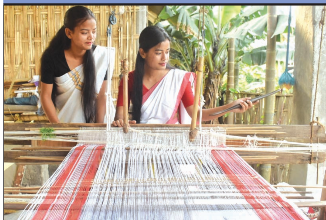
Girl weaving Assamese traditional Gamosa ahead of Rongali Bihu at Dhakuakhana on Tuesday.