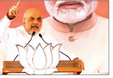
JAIPUR/KOTA, April 20: Accusing Congress leader Rahul Gandhi of spreading lies on the issue of reservation, Union home minister Amit Shah on Saturday said even if the opposition party wants to do away with quota given to SC, ST and OBCs, the BJP will not allow it to happen. Addressing rallies in Rajasthan, Shah also claimed that the Congress wanted to remove the ban on the Islamic extremist outfit Popular Front of India (PFI). He hit back at the opposition's claim that the BJP's slogan of winning