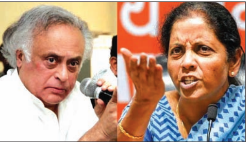
NEW DELHI, April 20: The Congress on Saturday hit out at the BJP over finance minister Nirmala Sitharaman's reported remarks that electoral bonds will be brought back after consultations, alleging that after looting ₹ 4 lakh crore of public money, they want to "continue the loot." Congress general secretary Jairam Ramesh's attack on the BJP came after Sitharaman told the Hindustan Times that the Bharatiya Janata Party (BJP) intended to bring back electoral bonds in some form after consultations with all stakeholders if it is elected back to power after the 2024 general election. In a post on X, Ramesh said, "Finance Minister Nirmala Sitharaman has declared that if the BJP returns

to power, they will bring back the Electoral Bonds that the Supreme Court declared unconstitutional and illegal!" "We know that the BJP looted ₹ 4 lakh crore of public money in the #PayPM scam. Now they want to continue the loot," he alleged. Ramesh listed what he said were the "four methods of PayPM." "Prepaid Bribery - Chanda do, Dhandha Lo. Postpaid Bribery - Theka Do, Rishvat Lo. Combined Cost of Pre-paid and Post-paid Bribes: ₹ 3.8 lakh crores," Ramesh said. "Post-Raid Bribery - Hafta Vasuli. Cost of Post-Raid Bribes: ₹ 1,853 crores. Farzi Companies - Money Laundering. Cost of Farzi Companies: ₹ 419 crores," he said. "This is the most important election of our lifetime. Thankfully, as ground reports make clear, this corrupt brigade is on its way out!" the Congress leader asserted. In February, the Supreme Court delivered a judgment striking down the electoral bonds scheme. Following a directive from the apex court, the State Bank of India, which was the authorised seller of electoral bonds, shared data on electoral bonds which was then made public. The Congress has alleged that the electoral bonds data has exposed "corrupt tactics" of the BJP such as quid pro quo and grant of "protection" to companies against donations. (PTI)