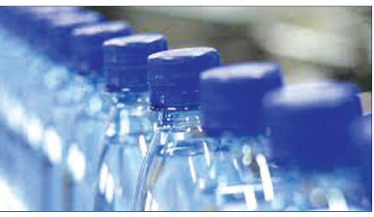
Burning fossil fuels is the primary reason for the increasing concentrations of greenhouse gases in the atmosphere, which are driving up global temperatures. The study suggests that primary plastic production needs to decrease by around 12 to 17 per cent per year starting in 2024 to avoid breaching the 1.5 degrees Celsius limit set by the Paris Agreement. In 2019 alone, primary plastic production generated about 2.24 gigatonnes of carbon dioxide equivalent (GtCO2e), which is 5.3 per cent of

NEW DELHI, April 20: If the current rate of plastic production continues, it could use up the global carbon budget to limit global warming to 1.5 degrees Celsius by as early as 2060 or no later than 2083, according to a new study. The study by the United States' Lawrence Berkeley National Laboratory (LBNL) comes ahead of the fourth round of United Nations negotiations for an international treaty to end plastic pollution in Ottawa, Canada, during April 23-29. It is estimated that global plastic production today accounts for around 12 per cent of total demand for oil and 8.5 per cent of total demand for natural gas. Greenhouse gas emissions during primary plastic production come from burning fossil fuels for heat and electricity, and other processes that don't involve burning. About 75 per cent of these emissions happen before the plastic is even formed.