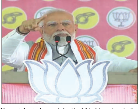
Karnataka today and the 'josh' in his voice, is the testimony for Karnataka's bright future," he said, as he thanked Gowda for his "blessings". The JD(S) joined the NDA in September last year. Earlier, in his speech, Gowda hit out at Congress, chief minister Siddaramaiah and deputy chief minister D K Shivakumar over a sarcasm-laced newspaper advertisement campaign alleging that the Modi government's gift to Karnataka was empty 'Chombu' (a small, round water container). Pointing at scams like 2G and coal gate during UPA rule under Manmohan Singh and Sonia Gandhi, he said, "After looting the resources of the state and the country during the Congress regime, Modi was given the empty 'Chombu', which the prime minister has turned into 'Akshaya Patre' in ten years." Modi, later addressing a public rally in Bengaluru, said in the 2014 and 2019 general elections, people gave a record (CONTD. ON PAGE-2)

April 20: Prime Minister Narendra Modi on Saturday said big and powerful people in India and abroad have joined hands to remove him from power. Addressing a mega public meeting in Chikkaballapura, near here, he said, "Mothers and sisters have come in a large number here. Your struggle and the challenges you face to nurture your family, Modi has seen this in his house. These days, big and powerful people in the country and abroad have united to remove Modi." "But, because of Nari Shakti and Maatru Shakti's blessings and Suraksha kavach (safety armour), Modi is able to move on fighting challenges." "Serving mothers, sisters and daughters and protecting them is Modi's priority," he said, listing out measures taken by his government for women's welfare in ten years like supporting their self help groups and creating 'Lakshmi Didis'. The prime minister said the first phase of voting for Lok Sabha on Friday has gone in favour of NDA and 'Viksit Bharat'. Targeting the INDIA bloc, he said the opposition alliance doesn't have a leader at present, and has no vision for future, and "their history was of scams." Praising JD(S) patriarch and former Prime Minister H D Deve Gowda who shared the stage with him, for his energy and commitment at the age of 90, Modi said he too draws inspiration from him. "His (Gowda) commitment towards Karnataka, the pain in his heart for the plight of