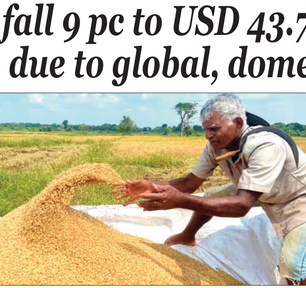
According to the data of the commerce ministry, the exports stood at USD 47.9 billion in April-February 2022-23.