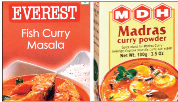
ministry official said. Technical details, analytical reports and the details of the exporters whose consignments have been rejected have been sought from Embassies at Singapore and Hong Kong, the official said.

NEW DELHI, April 23: India, the world's largest producer, consumer and exporter of spices, has sought details from food safety regulators of Singapore and Hong Kong, which has banned certain spices of Indian brands MDH and Everest due to quality concerns.