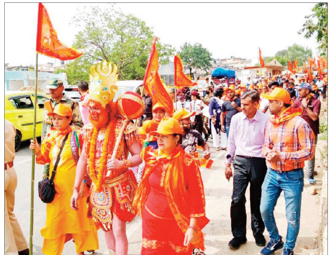
A procession was taken in Shillong from a temple in Garikhana to Anjalee Petrol Pump and back to Garikhana on the occasion of Hanuman Jayanti on Tuesday.

DCCI further appealed to civil society organizations and the public to support the indefinite shutter down call.