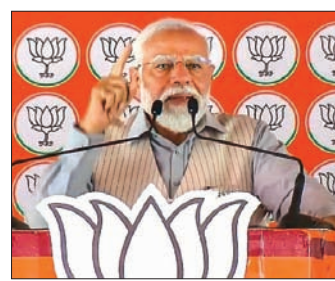
proved that today's Congress is completely cut off from the hopes and aspirations of today's India," he added addressing an election rally in Saharanpur.

"Yesterday, the kind of election manifesto was released, it has