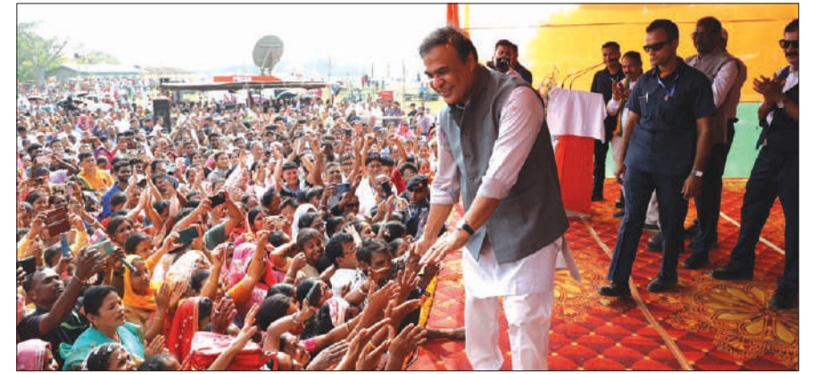
JORHAT, April 6: Chief Minister Himanta Biswa Sarma rallied supporters in Jorhat, calling upon them to strengthen the hands of Prime Minister Narendra Modi by voting for the Bharatiya Janata Party (BJP).

State govt's poll sops: 50,000 more jobs, more benefits for ration card holders