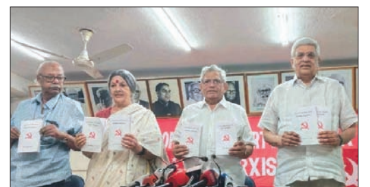
army of RSS is trying to change the Constitution and ultimately replace it," he alleged.

"The Constitution is under attack. BJP being political