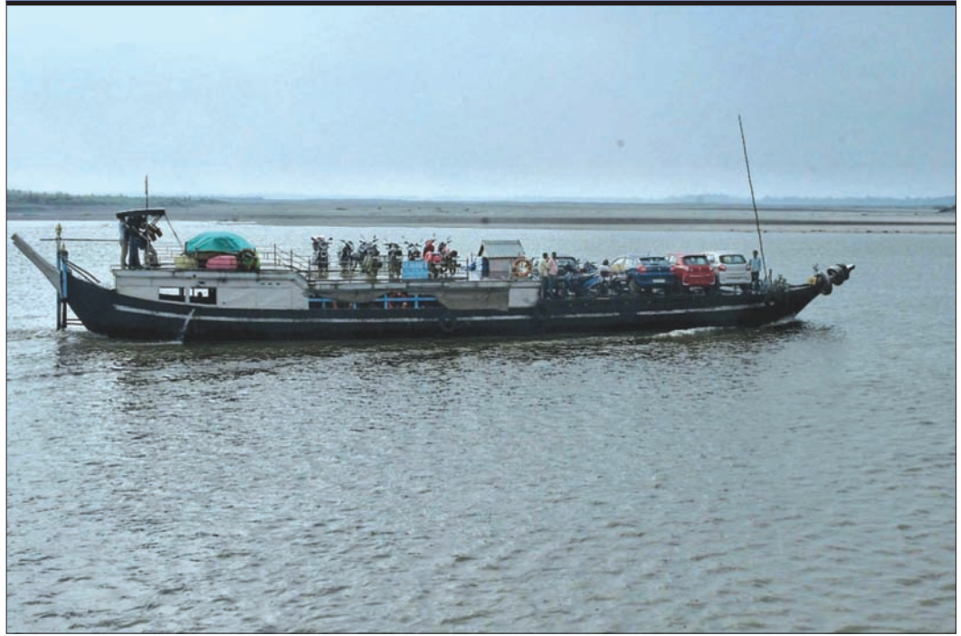
A ferry crossing the Brahmaputra river at Nimatighat.