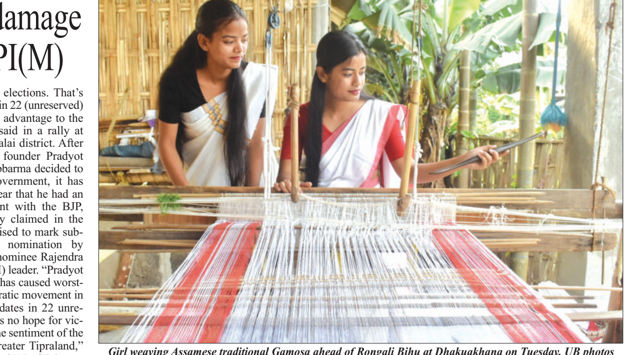
Girl weaving Assamese traditional Gamosa ahead of Rongali Bihu at Dhakuakhana on Tuesday.