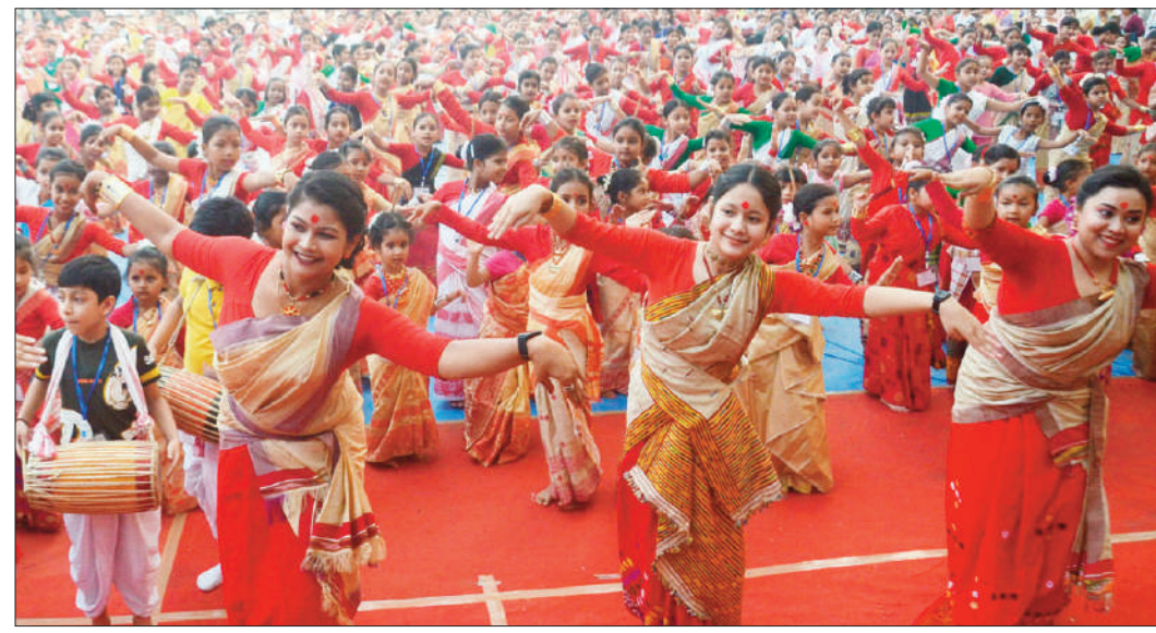
Children and young girls in traditional Assamese attire participated in the opening day of the 10-day-long Bihu dance and dhol (drum) badan workshop organised by East Guwahati Bihu Sammilan ahead of the Rongali Bihu festival at AEI Playground in Chandmari, Guwahati, on Tuesday.