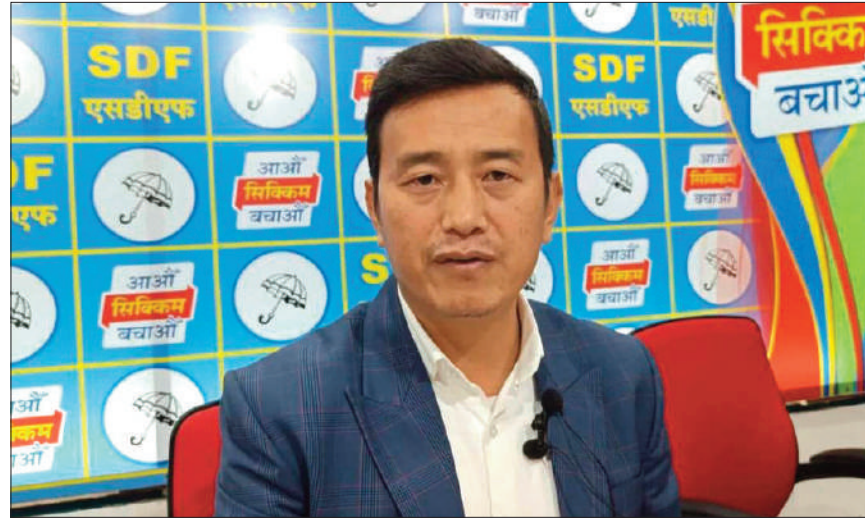
party, Hamro Sikkim with the SDF.

45-year-old Bhutia buried all his differences with the SDF supremo and merged his