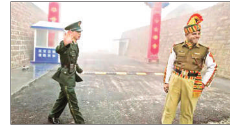
of China after May 2020. He also questioned why the government "did not get it vacated" and was instead resorting to "deflections and deceptions" on the issue.

Congress senior spokesperson Manish Tewari said the "strange" statement of Jaishankar only shows the weakness of the government. "It has been such a weak and inflexible response to China's cartographic aggression in Arunachal Pradesh, that it has changed the names of 30 places. Such a weak response does not suit the Government of India and especially does not suit the foreign minister of India," he said. Tewari asked how much land is in control