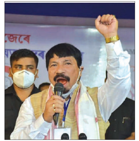
very positive results in Dhubri," he added. The regional party formed its first government in the state in 1985 and returned to power, with help of other parties, in 1996. Since 2001, it was in the opposition until 2016, when it returned to power as part of a coalition led by (CONTD. ON PAGE-2)

The state agriculture minister said that the "changed demography post-delimitation will help the AGP in winning both the seats". The AGP is contesting from Dhubri and Barpeta constituencies, with the BJP fielding its nominees in 11 seats and United People's Party Liberal (UPPL) in one. Assam sends 14 MPs to the Lok Sabha. Bora said though the AGP, as an ally of the BJP, had unsuccessfully contested from Barpeta in the 2019 general elections, the demographic structure of the constituency has changed due to delimitation, and the party is expecting to win the seat this time. He also sounded optimistic about winning in Dhubri, though chief minister Himanta Biswa Sarma has been expressing doubts about the NDA candidate emerging victorious there. "Population structure is somewhat different in Dhubri, it is mostly a Muslim-majority area. Perhaps, his (Sarma's) observation stems from that angle," Bora said, in an apparent reference to the BJP's limited influence in Muslim areas. "But these days, our party workers are moving around. Not only AGP, the BJP and UPPL are also working together. We are expecting