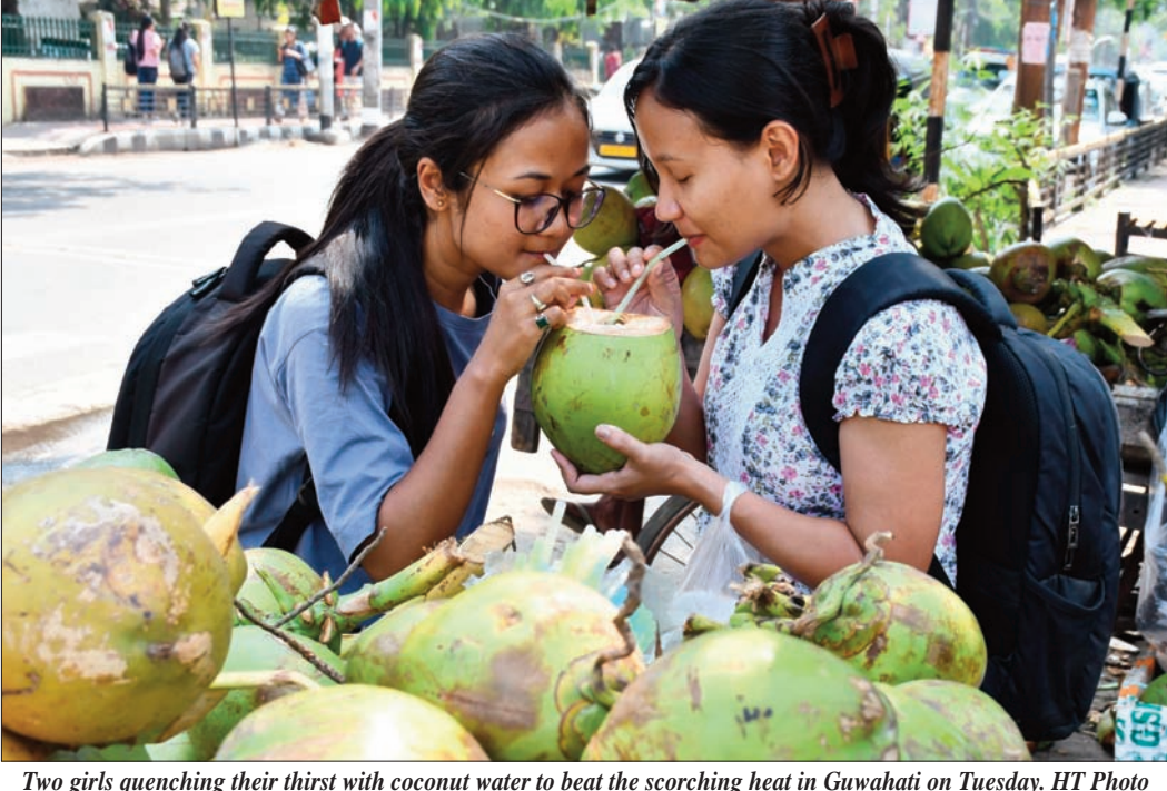
Two girls quenching their thirst with coconut water to beat the scorching heat in Guwahati on Tuesday.