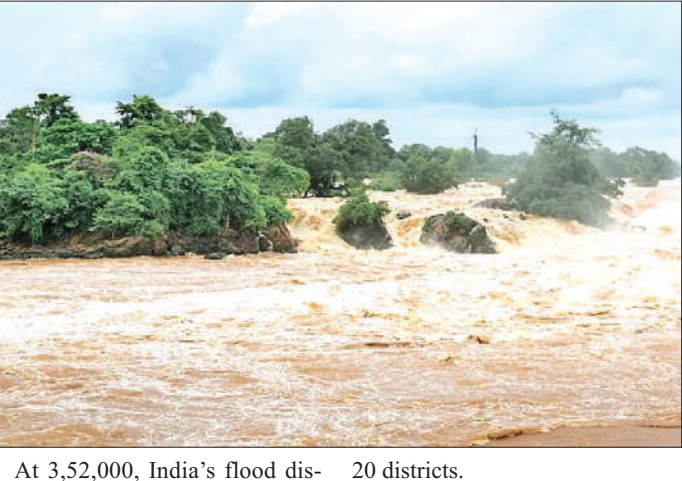
At 3,52,000, India's flood displacement figure was the lowest since 2008, with the largest event triggering about 91,000 displacements in Assam in June, affecting 20 districts.

The report by the Geneva-based Internal Displacement Monitoring Centre (IDMC) said around 27,000 displacements in the national capital. On July 9, Delhi recorded 153 mm of rainfall in just 24 hours, the highest single-day rainfall since July 25, 1982.