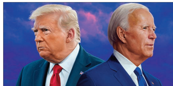
By: Antoni Kapcia

In early 2021, Cubans faced a triple crisis. Since 2017, Donald Trump had decreed 243 presidential measures to make the long-standing US embargo tighter than at any time since the mid 1960s. The COVID-19 pandemic exacerbated the problem by closing Cuba's borders to tourism, a major source of hard currency. Meanwhile, in January 2021, the long-awaited fusion of Cuba's challenging dual currency system generated worrying uncertainties and rising prices for many.