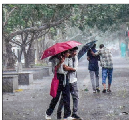
Kasaragod until Thursday night, authorities added.

A state-level rapid response team had already been formed by the department for epidemic prevention, she said in a statement. The control room has been launched with the objective of coordinating various activities under the Health Department and clearing the doubts of health workers and the general public, the minister added. (PTI)