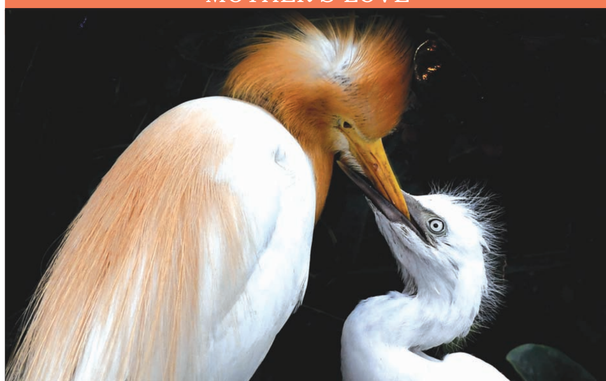
A cattle egret is busy feeding its offspring at its nest on a tree in Guwahati on Wednesday.